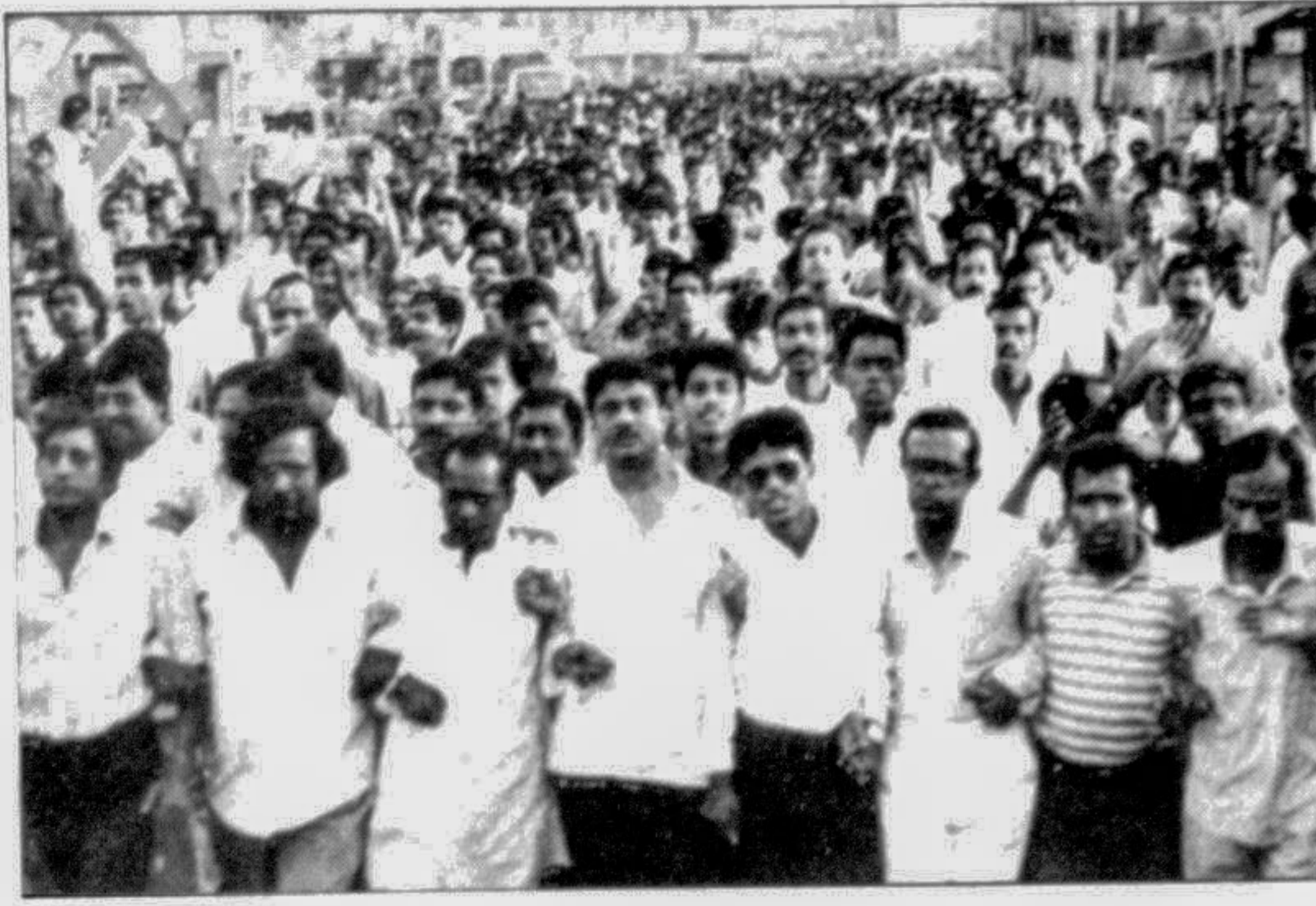
City Awami League brought out a procession yesterday protesting police attack on Nirmul rally.