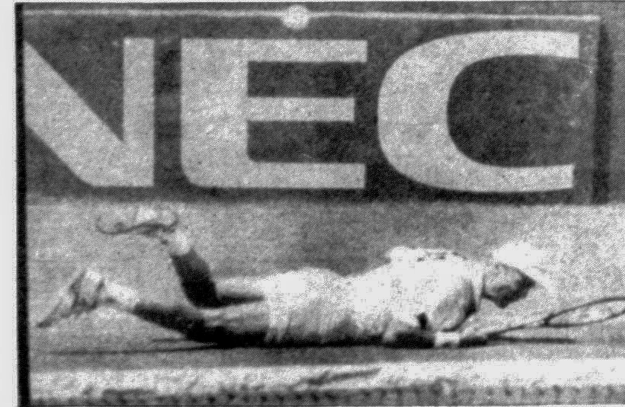
Jakob Hlasek goes sprawling after attempting a backhand return against Ramesh Krishnan during their Davis Cup reverse singles match at the South Calcutta Club court on March 28. India knocked outlast year's runners-up Switzerland when Krishnan clinched the deciding game against Hlasek 6-3, 6-4, 6-2.