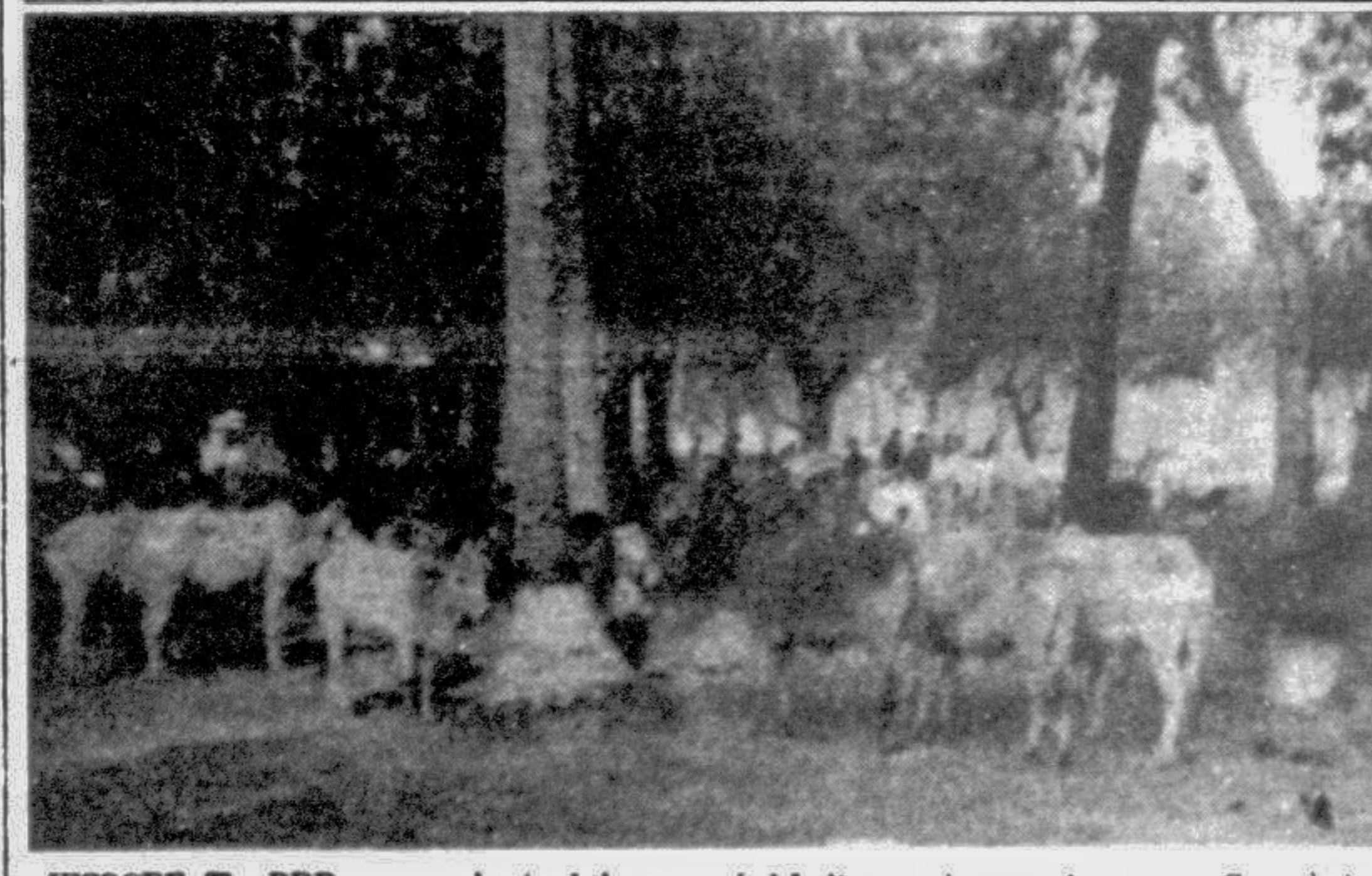
JESSORE: The BDR personnel seized the smuggled Indian cattle recently.

Organised gangs of gamblers cheat the passengers especially the labour class through three cards. The railway police and security guards on duty in the local trains remain silent, it is alleged.