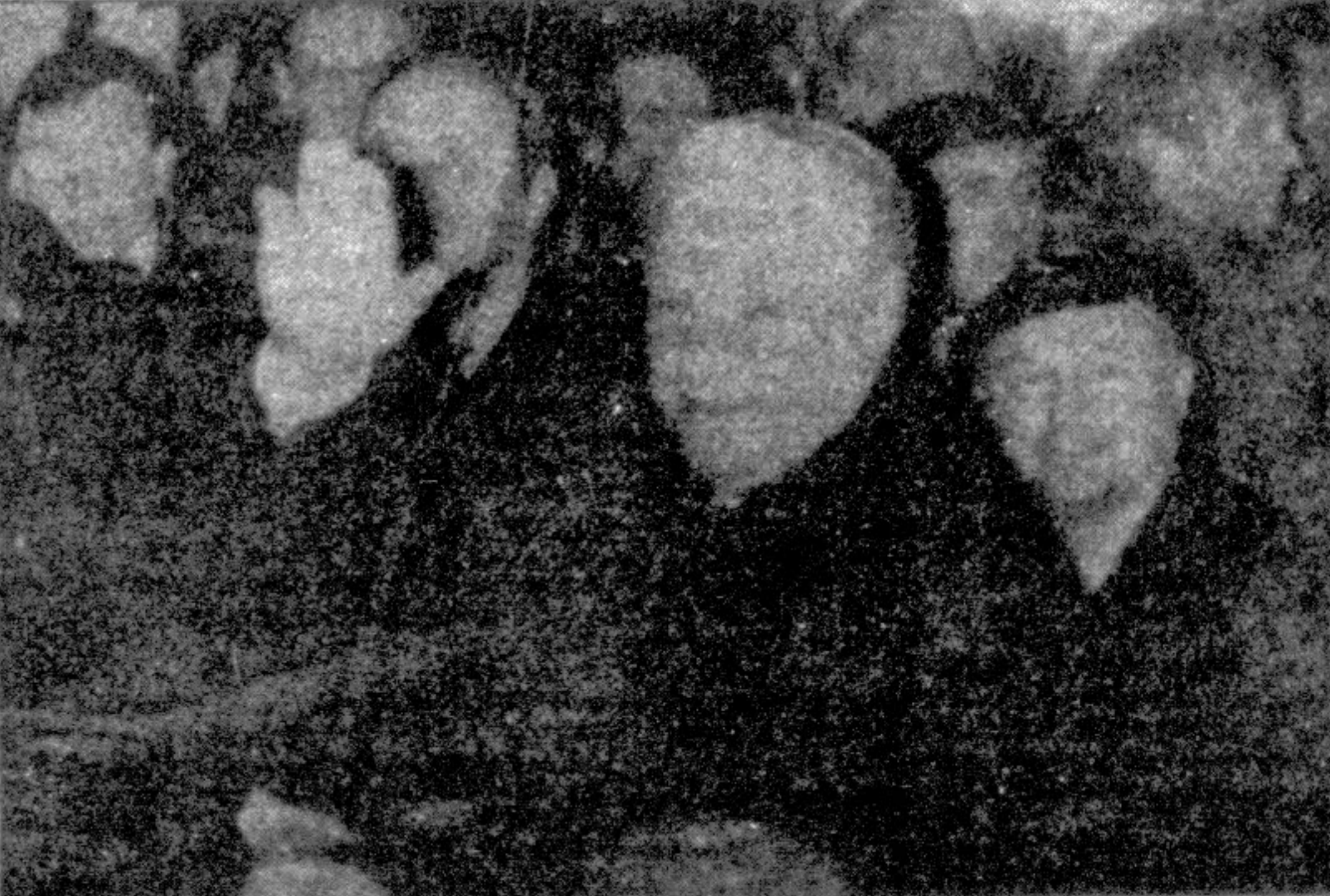
Russian President Boris Yeltsin waves to people in the street as he goes for a short walk in the centre of Moscow Saturday after the end of the second day of the extraordinary Congress of People's Deputies.

However, some question marks still surround the 66-year-old Jiang who now seems firmly installed as patriarch Deng Xiaoping's eventual successor. Jiang, an uncharismatic bureaucrat, was elected President Saturday by the National People's Congress, or parliament, taking over from the 86-year-old Yang Shangkun who stepped down. Jiang is China's fifth President and will retain the titles of party general secretary and chief of the armed forces. Despite Jiang's trilateral position of influence, the real