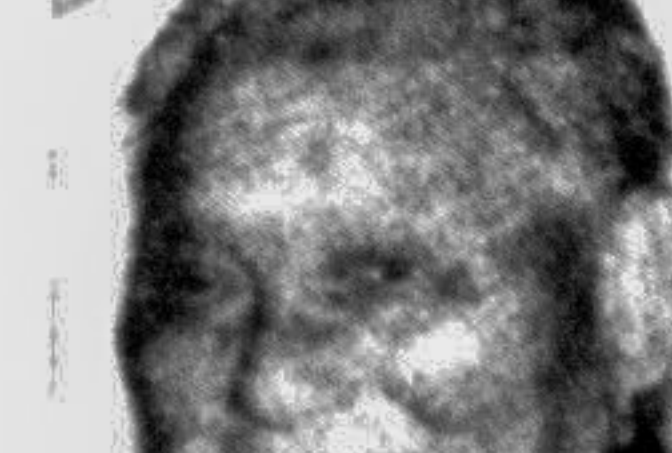
Deng Xiaoping confirm his legitimacy as army chief to the three million members of the Peoples Liberation Army (PLA).

confirm his legitimacy as army chief to the three million members of the Peoples Liberation Army (PLA). While his predecessor as head of state Yang Shangkun