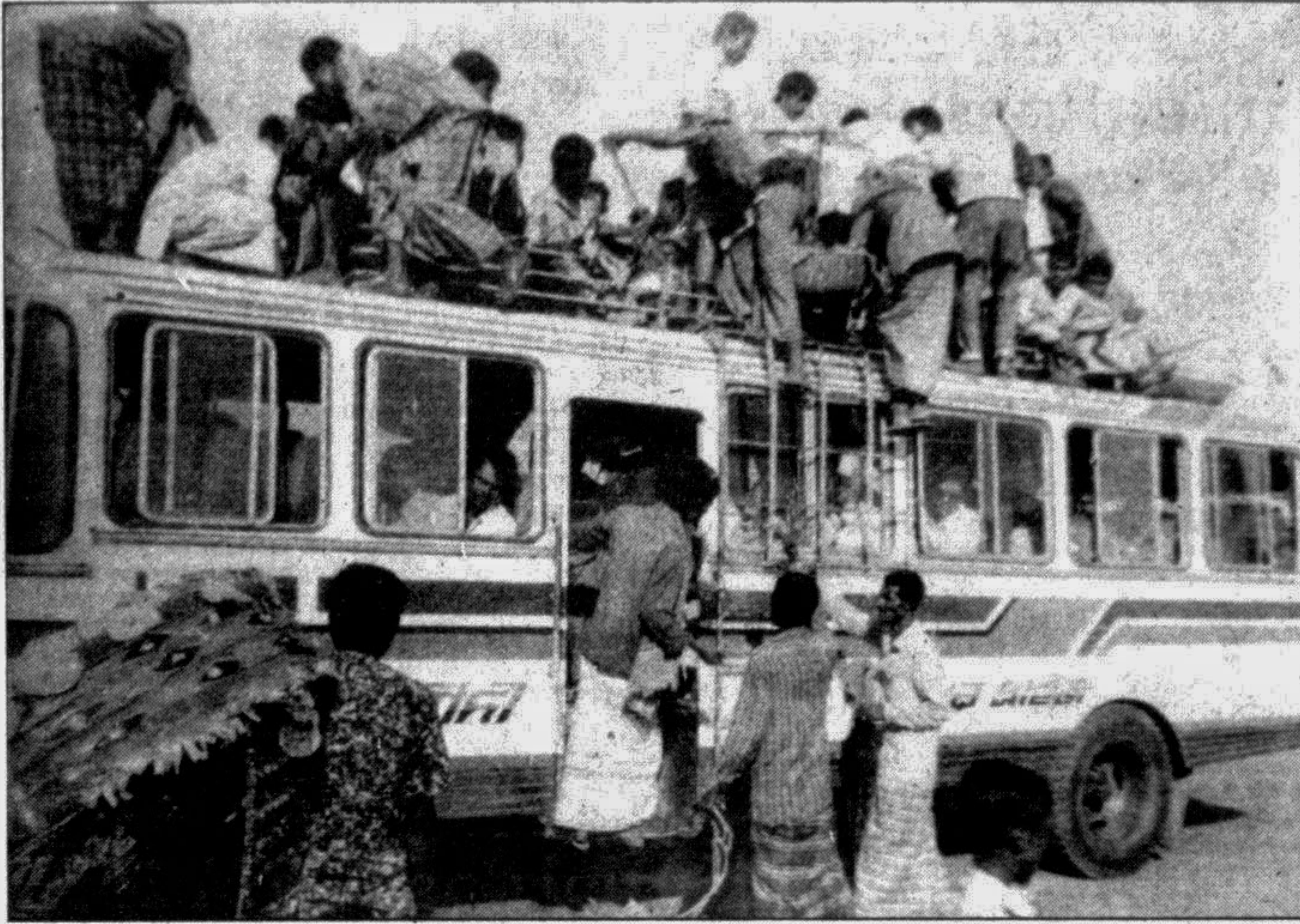
NATORE: Overloading of passengers and goods on different routes has become a common feature.