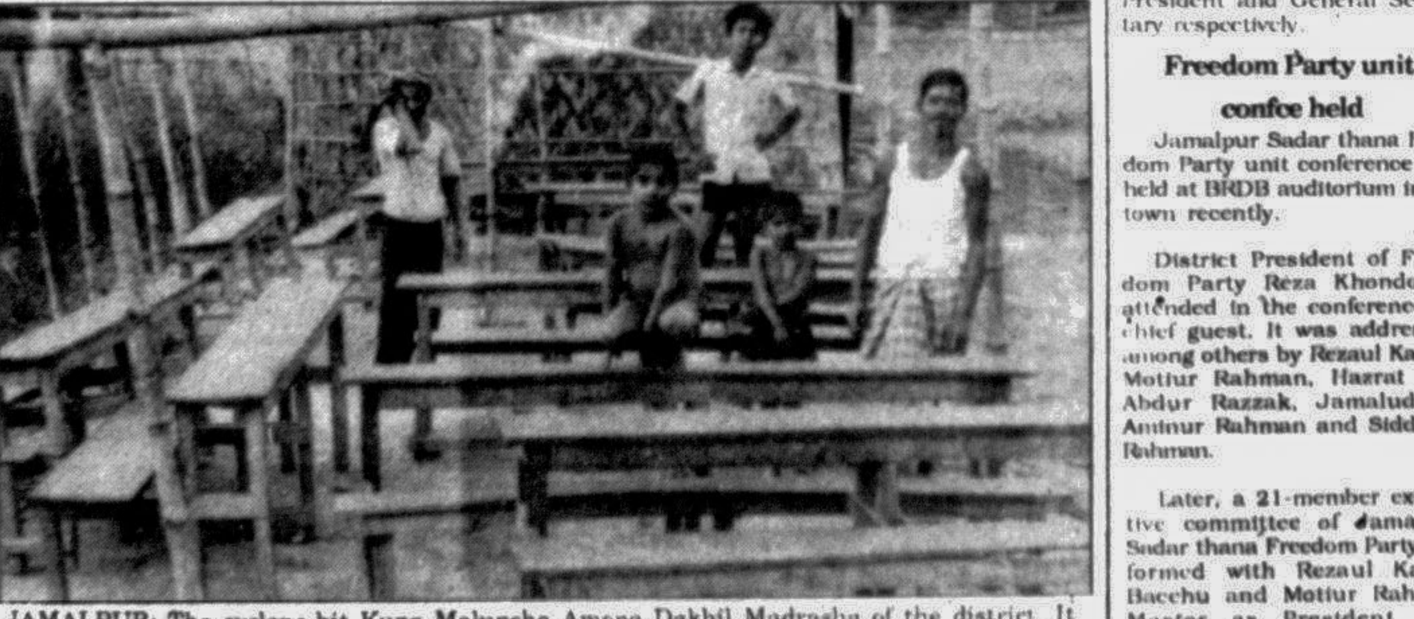
JAMALPUR: The cyclone-hit Kuna Maluncha Amena Dakhil Madrasah of the district. It needs early repair.

GHORASHAL, Mar 27: Country's daily production of electricity is expected to rise to 2,541 Megawatt, 591 MW more than the national demand, by next December on completion of two power plants, reports UNB. At present the country produces on an average 1,650 MW of electricity per day against the demand of 1,750 MW. The two power plants — Rajganj Power Plant in Chittagong and the 5th unit of Ghorashal Thermal Power Plant — will go into operation by April and December this year respectively. The staggering loadshedding problem will be minimised to a great extent on completion of these two projects, said Syed Mohiuddin Ahmed, Chief Engineer of Operation and Maintenance Division of Ghorashal Thermal Power Plant. He told a visiting group of journalists on Saturday that 72 per cent work of the 5th unit of Ghorashal Power Plant had already been completed. The construction of the unit, a Taka 576.11 crore project, beginning 1988-89 with financial and technical assistance from Russia. Meanwhile, an agreement was signed between Bangladesh and Russia on January 15 last year to set up another 210 MW power unit, the 6th unit of Ghorashal Power Plant. The construction of the unit costing Taka 493 crore is likely to start by next January. It is expected to go into operation by March, 1996. On completion of 5th and 6th units, Ghorashal Power Station with 950 MW capacity will be the biggest power station complex in the country. The present installed generation capacity of the complex is 530 MW.