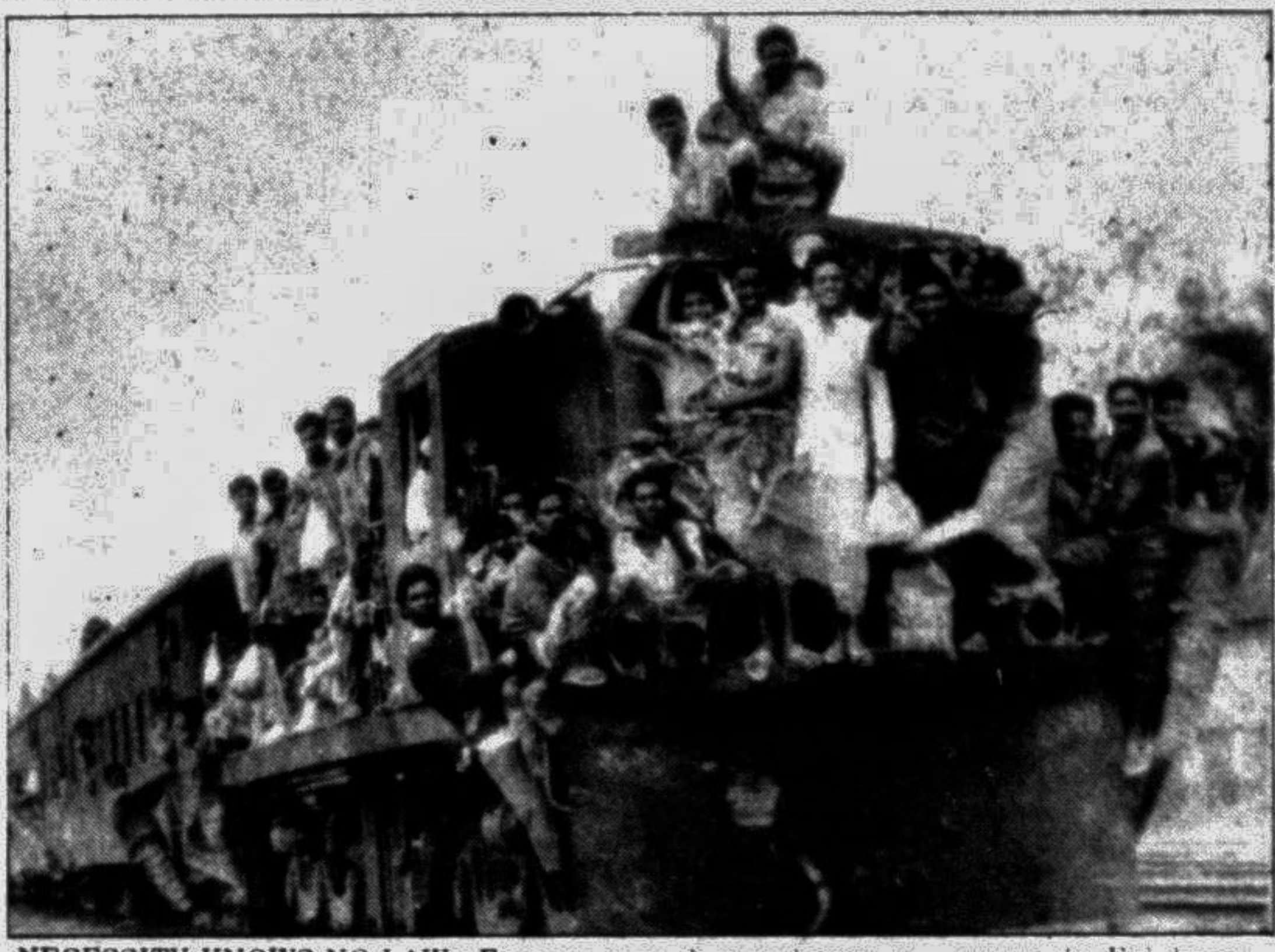
NECESSITY KNOWS NO LAW : Eager to meet dear and near ones during the Eid, home-bound people swarmed the engine and even climbed to roofs of the coaches of an outgoing train at Kamalapur Station yesterday.