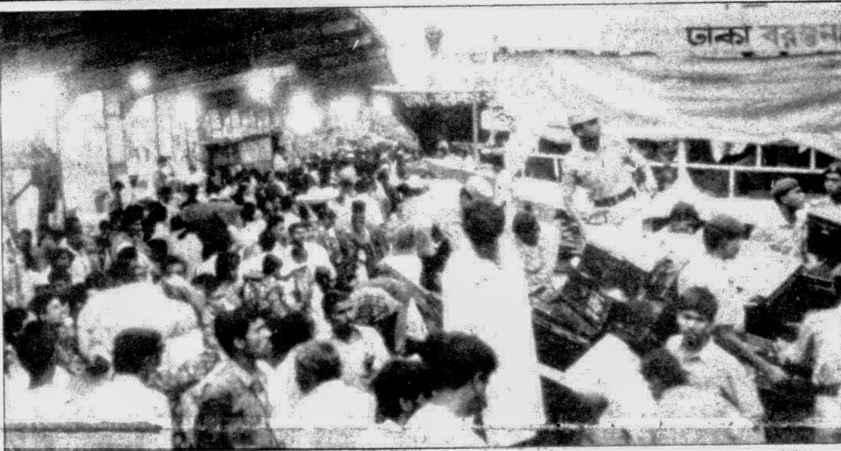
EID RUSH: Home-bound people crowding launch terminal at Sndarghat.