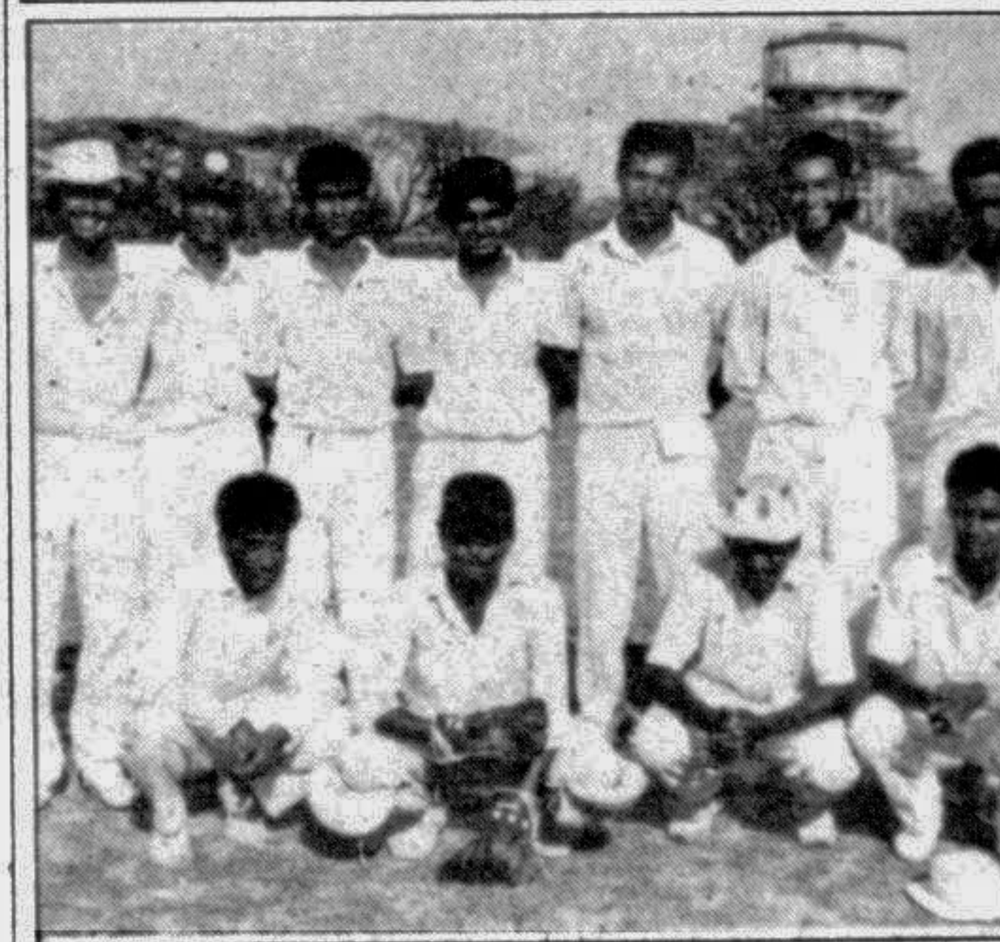
SYLHET: Anirban Krira Chakra became the unbeaten champions in the Power First Division Cricket League held at the Sylhet stadium recently. They defeated white Mohammedans by 84 runs.

According to the reports, the fire originated from the sweetmeat shop of one Hiralal Pal soon spread to the adjacent shops. Four shops were gutted in the fire. Upon hearing, Fire Service personnel from Sylhet reached the spot but the local people had brought the fire under control before their arrival.