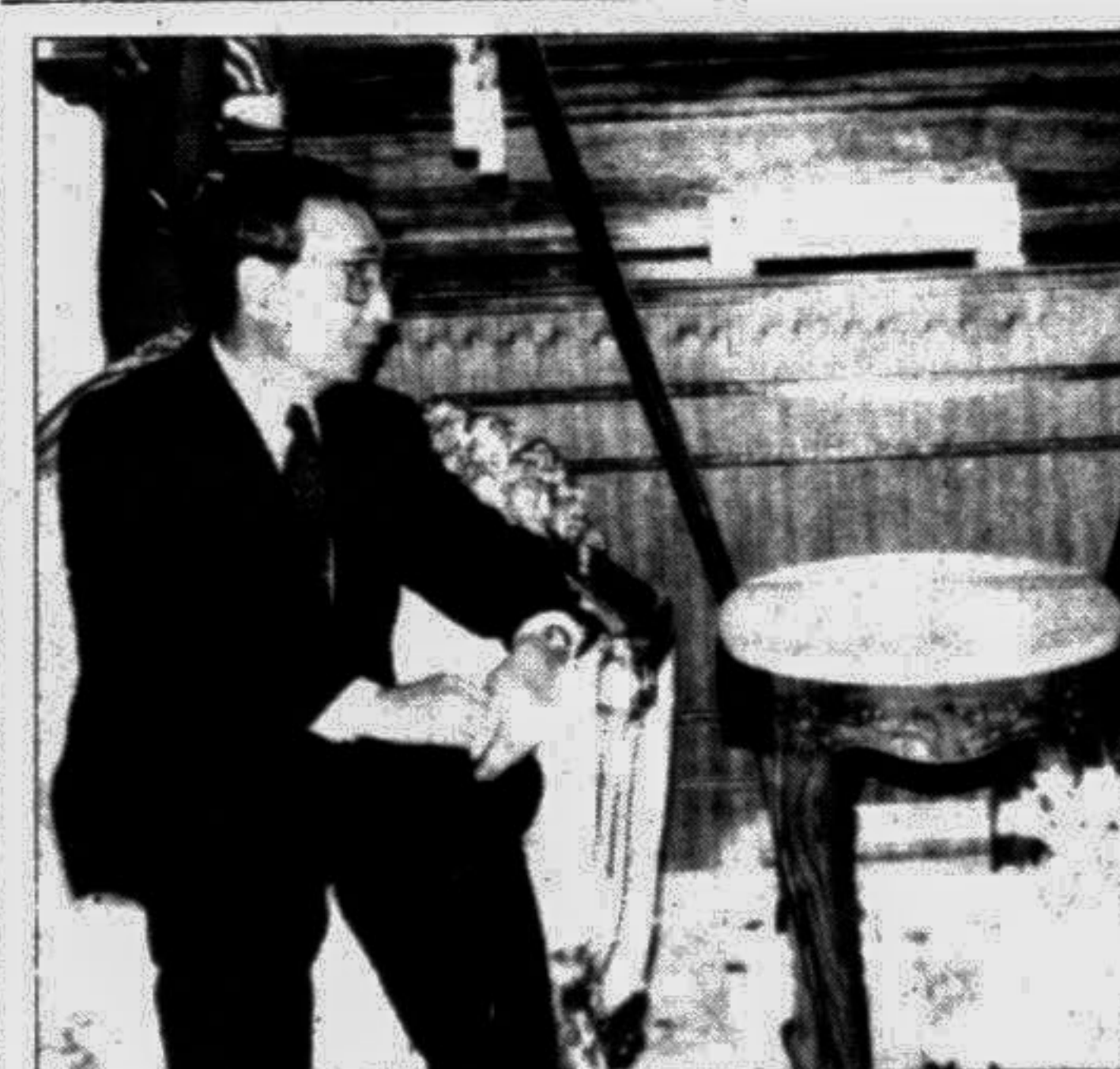
Japanese Ambassador to Bangladesh Toshio Saiki made a farewell call on Prime Minister Begum Khaleda Zia at her office yesterday.