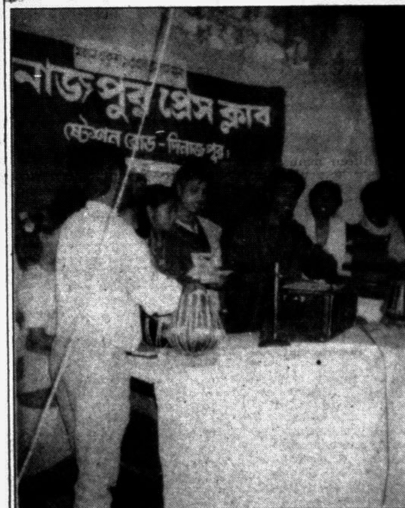
DINAJPUR: Artists are rendering songs at a cultural function held at the Dinajpur Press Club recently.

Meanwhile, mobile court of PDB realised a fine of Taka 91,500 from 69 people for using electric connections illegally and snapped 110 connections in the last February.