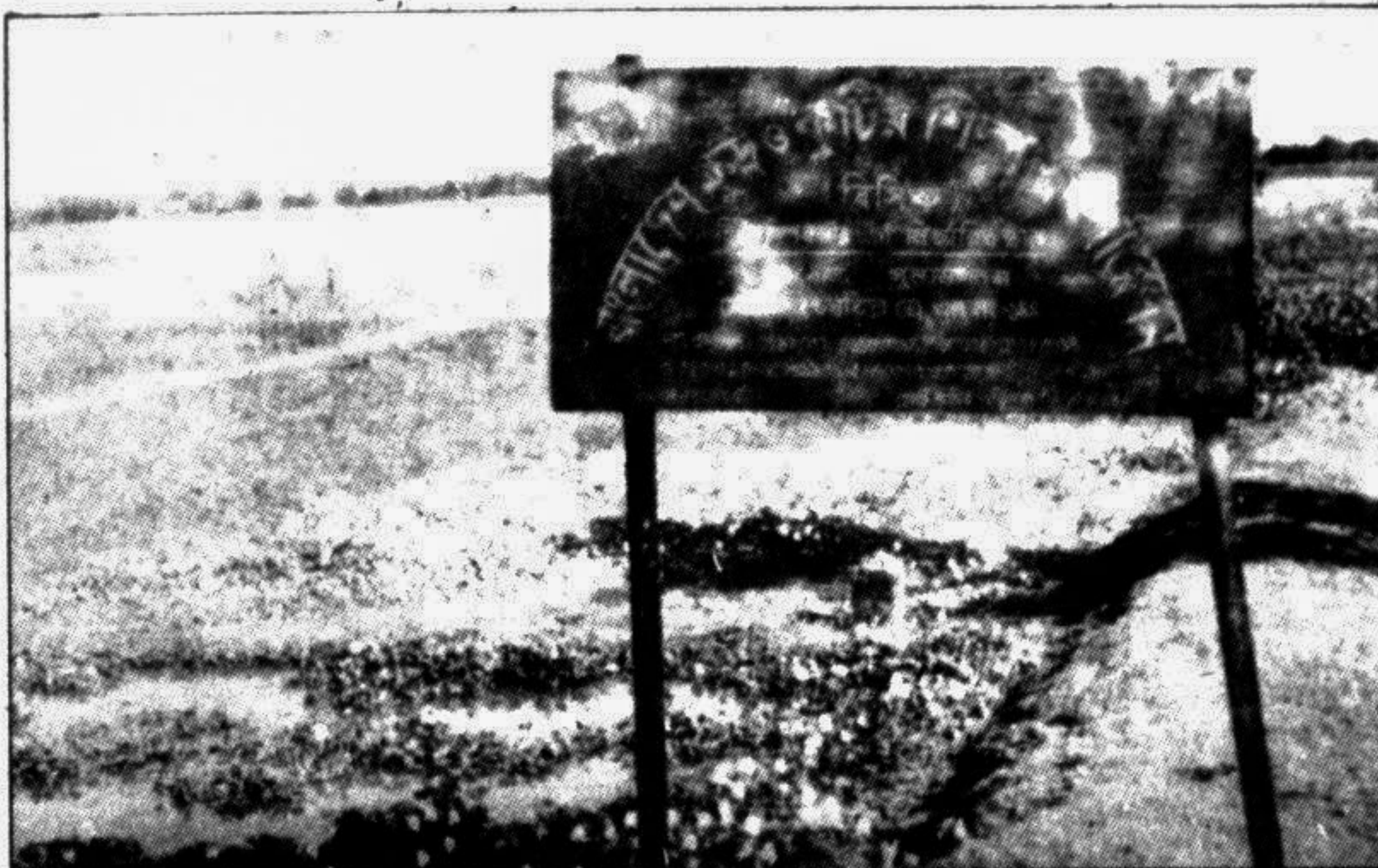
SYLHET: The BSCIC acquired lands in Sunamganj to set up an industrial estate. The lands have lying unused for years together.

About 2,000 deep, 3,000 shallow tubewells and 1,500 power pumps of Barendra Multipurpose Development Project are engaged in irrigation network to make the scheme a success.