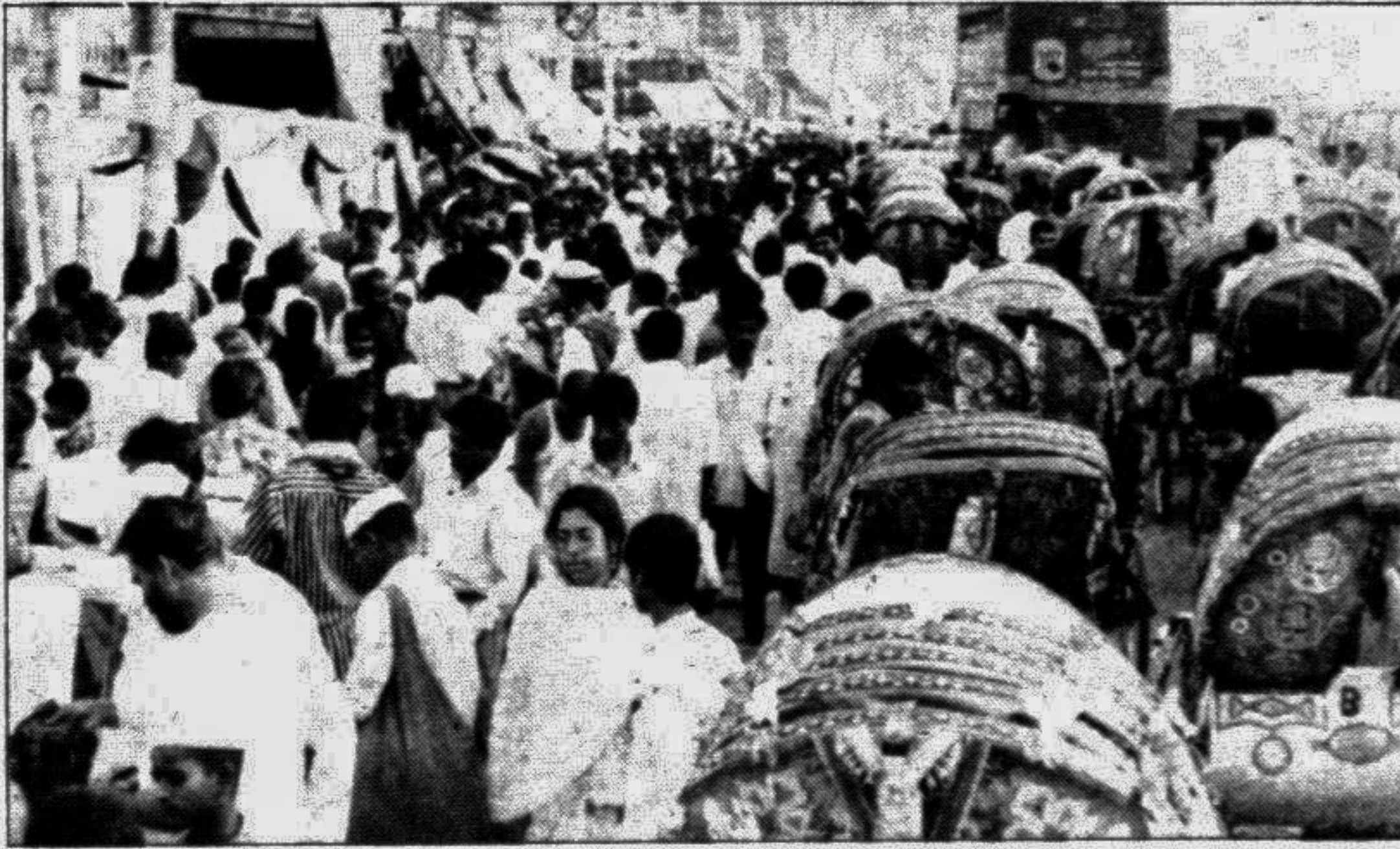
Hectic Eid shopping at Bangabandhu Avenue in the city yesterday.

Nearly 700 medical teams, one in every union of the affected areas, and over 200 temporary mobile teams are working around the clock to combat the scourge.