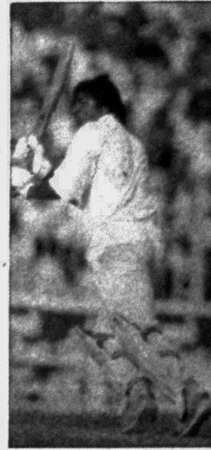
INZAMAMUL HAQ ... 106