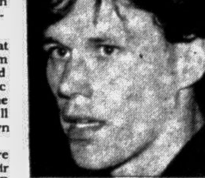
MARCO VAN BASTEN

The Netherlands' PSV Eindhoven, like Porto out of the running in the group, travel to IFK Gothenburg without injured Romanian sweeper Giga Popescu.