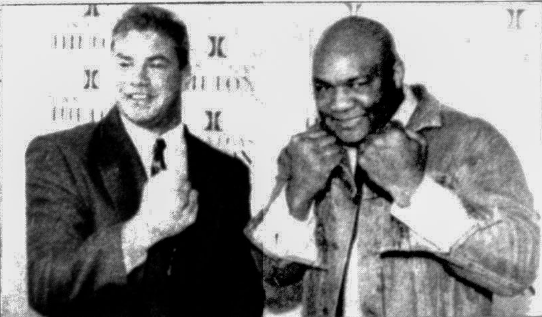
Heavyweight boxers George Foreman (R) and Tommy Morrison joke during a news conference in Las Vegas on Mar 16. They announced their World Boxing Organization title bout scheduled for June 7 at the Thomas and Mack Centre. Foreman, 40, is 20 years older than Morrison.

FIFA said in a statement issued in Sydney that it had decided on the date of April 15 after consulting its international calendar and the fixture list for the African Nations' Cup and considering submissions from both teams.