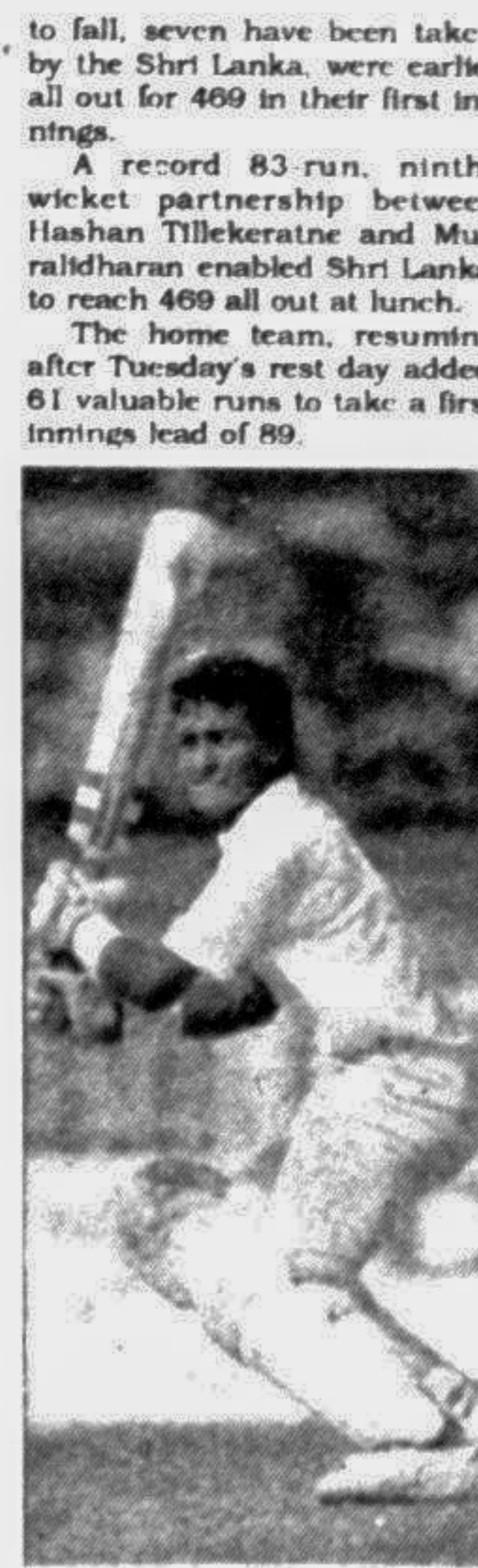
TILLEKERATNE... 93 n.o

COLOMBO, Mar 17: Sri Lanka's spinners bowled their country to the brink of a historic victory over England in the one-off Test here Wednesday, reports AFP.