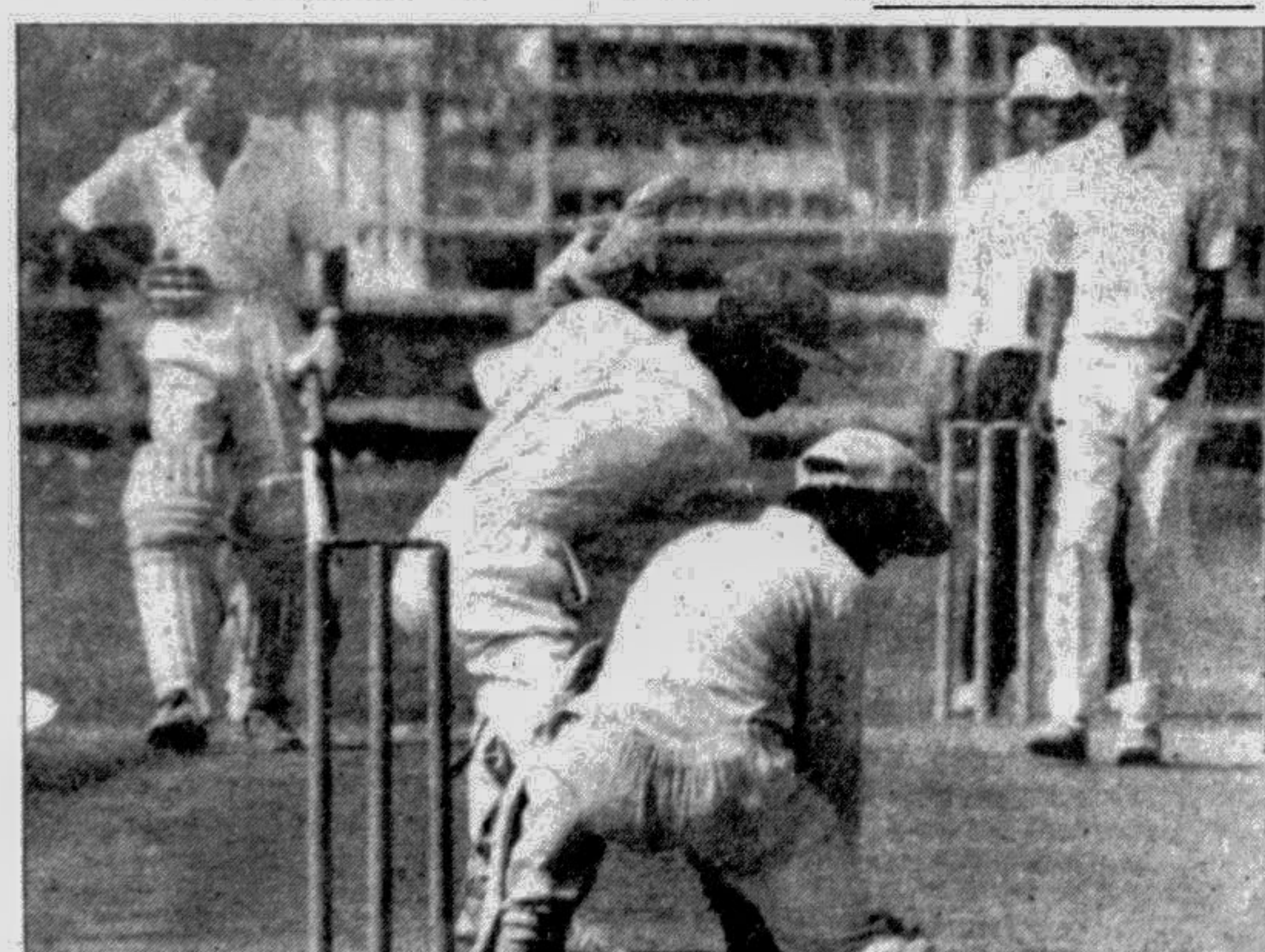
OH, NO!... a batsman misses his shot and the ball foels the wicketkeeper to race to the third-man boundary - a regular scenario at school-level cricket. This time during the match between BM School of Barisal and Comilla Zilla School at the Dhanmondi Club ground yesterday. BM School won.

PARIS, Mar 16: New French Davis Cup captain Georges Goven recalled 20-year-old Fabrice Santorio on Monday when he named his squad for a world group first round tie with Austria.