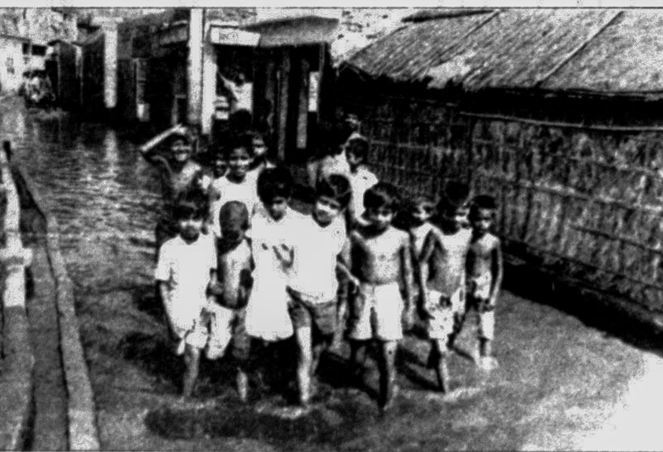
A sewerage line leak at Daikanagar in the city submerged the entire locality yesterday.