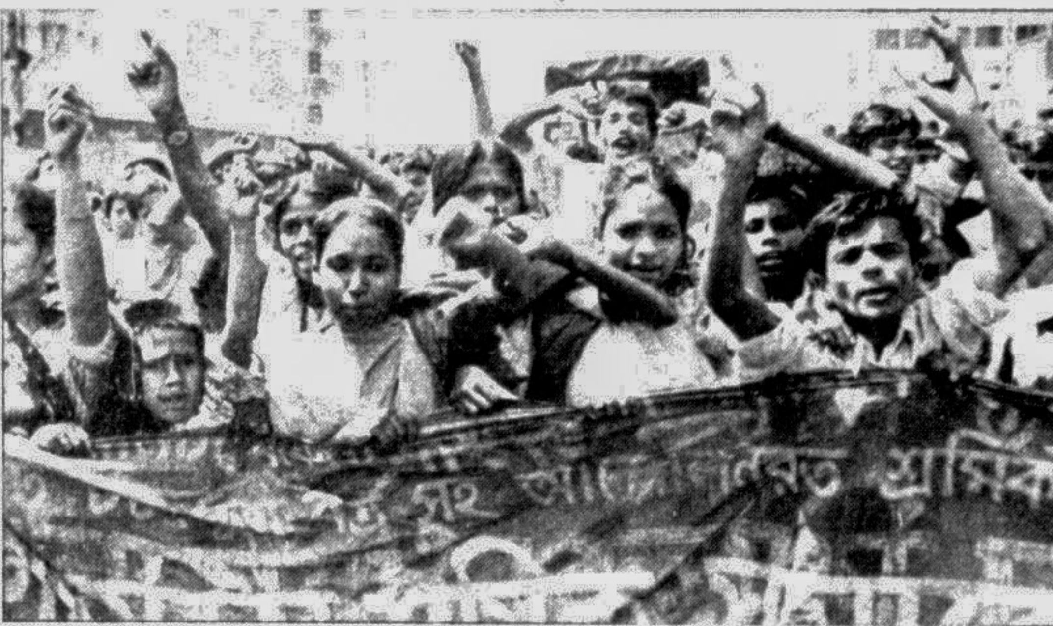
Garments workers brought out a procession in the city yesterday seeking release of their colleagues.

They said that they have come to learn that managements of some other organisations have threatened to take such repressive measures against the journalists working there. Meanwhile, they said in different newspapers being published from Dhaka and other parts of the country, salary and other legitimate benefits were not being paid to the working journalists.