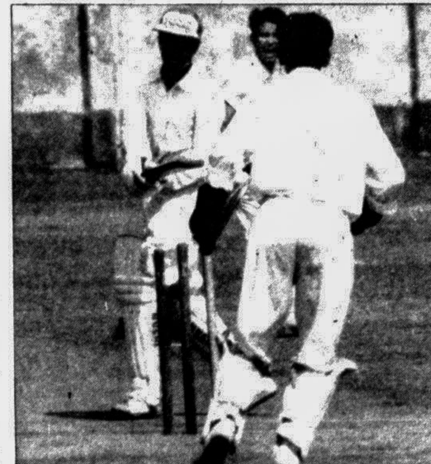
Action from the final round tie of the 11th Nirman schools cricket tournament between Dhaka's Willes Little Flower High School and Radhanagar M A School of Pabna at the Dhanmondi Cricket Stadium yesterday. Willes High won the match by four wickets.