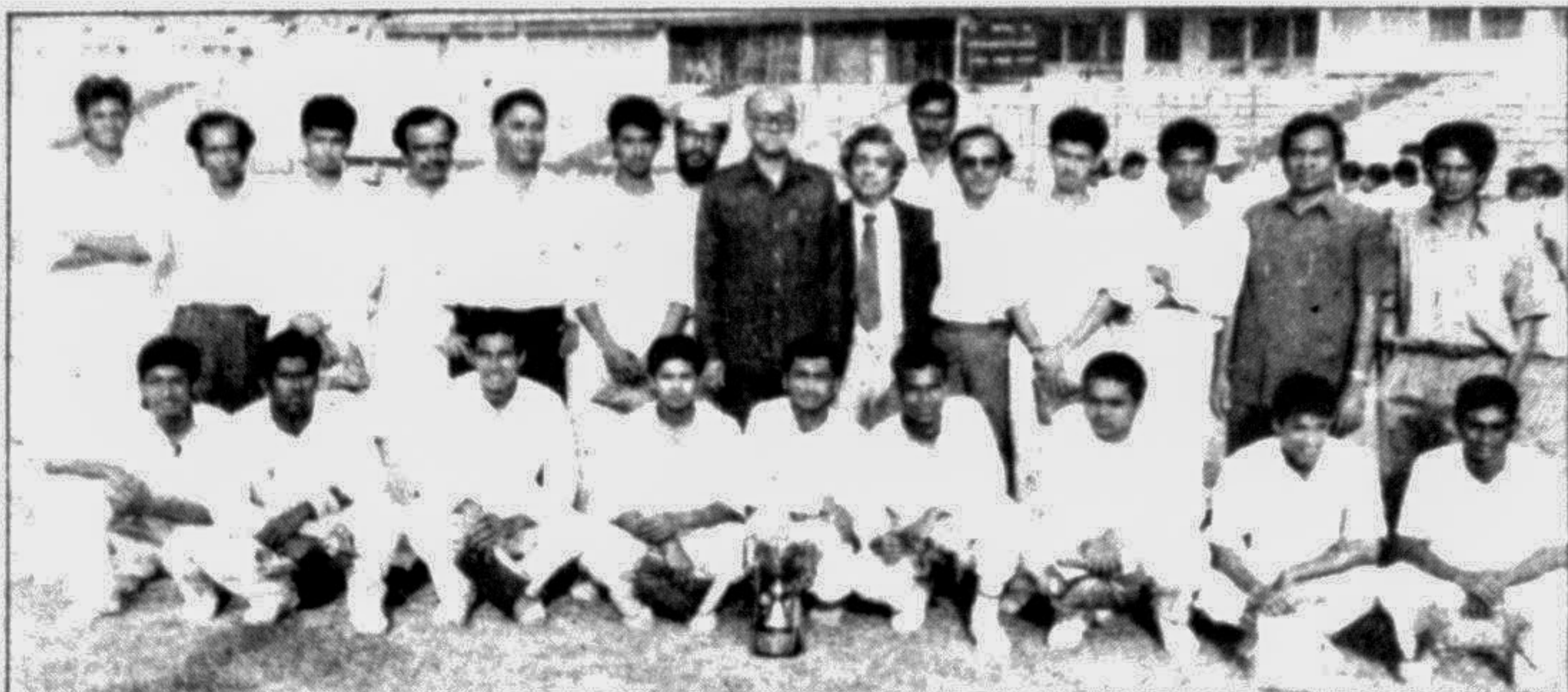
The players of Dhaka DSA, winners of the 13th Beximco national youth cricket championships, seen with the chief guest Foreign Minister ASM Mostafizur Rahman at the Dhaka Stadium yesterday. AF Sohel Rahman, chairman of the sponsoring company Beximco, is also seen, among others.