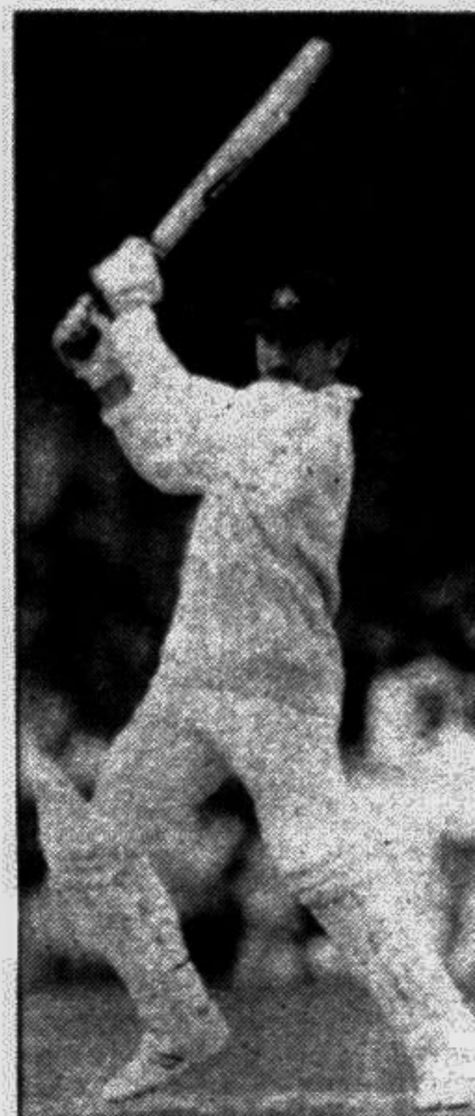
ALLAN BORDER... 61 n.o