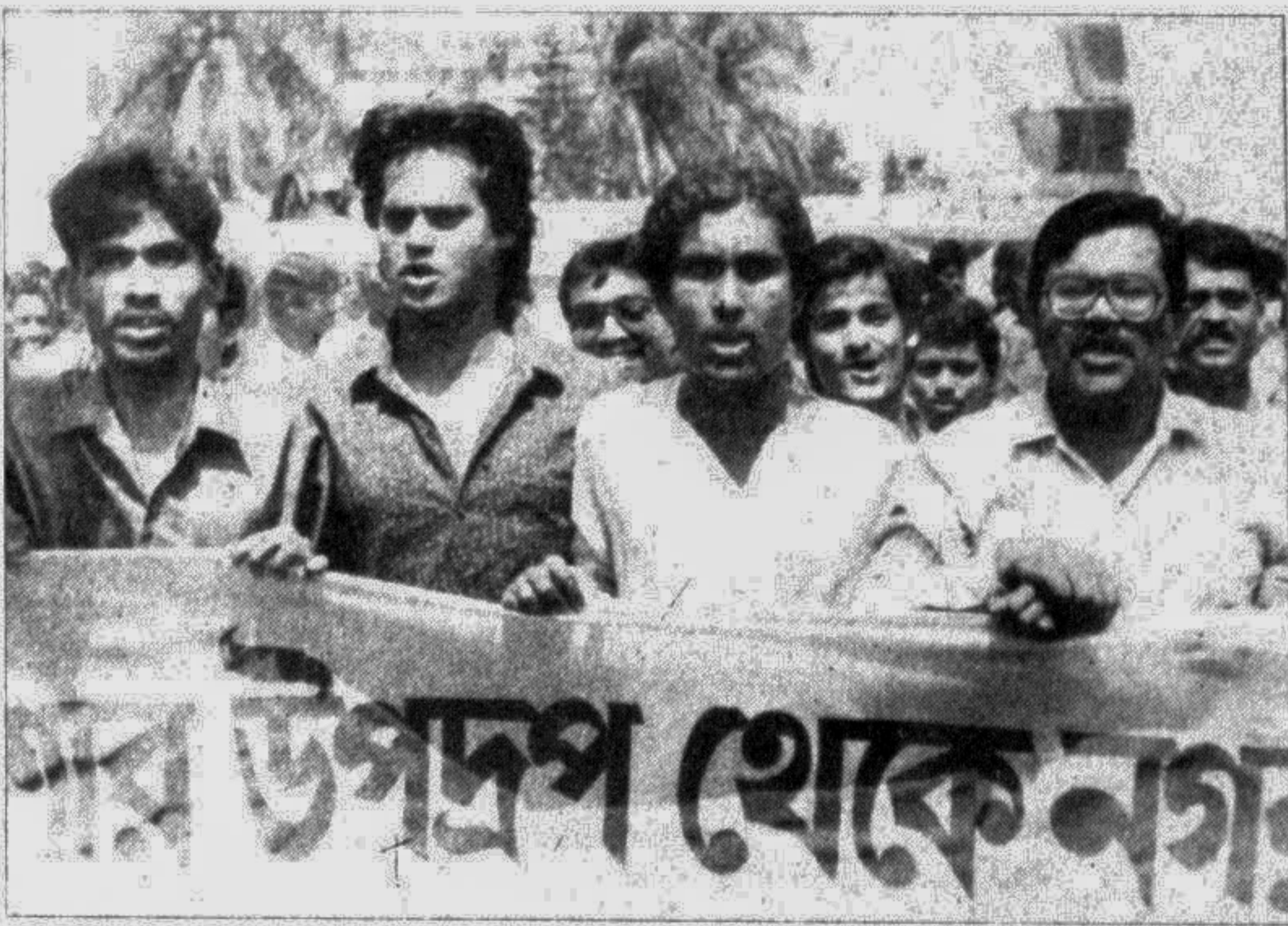
JSDX(Inu) held a demonstration in city yesterday demanding annihilation of mosquitoes.