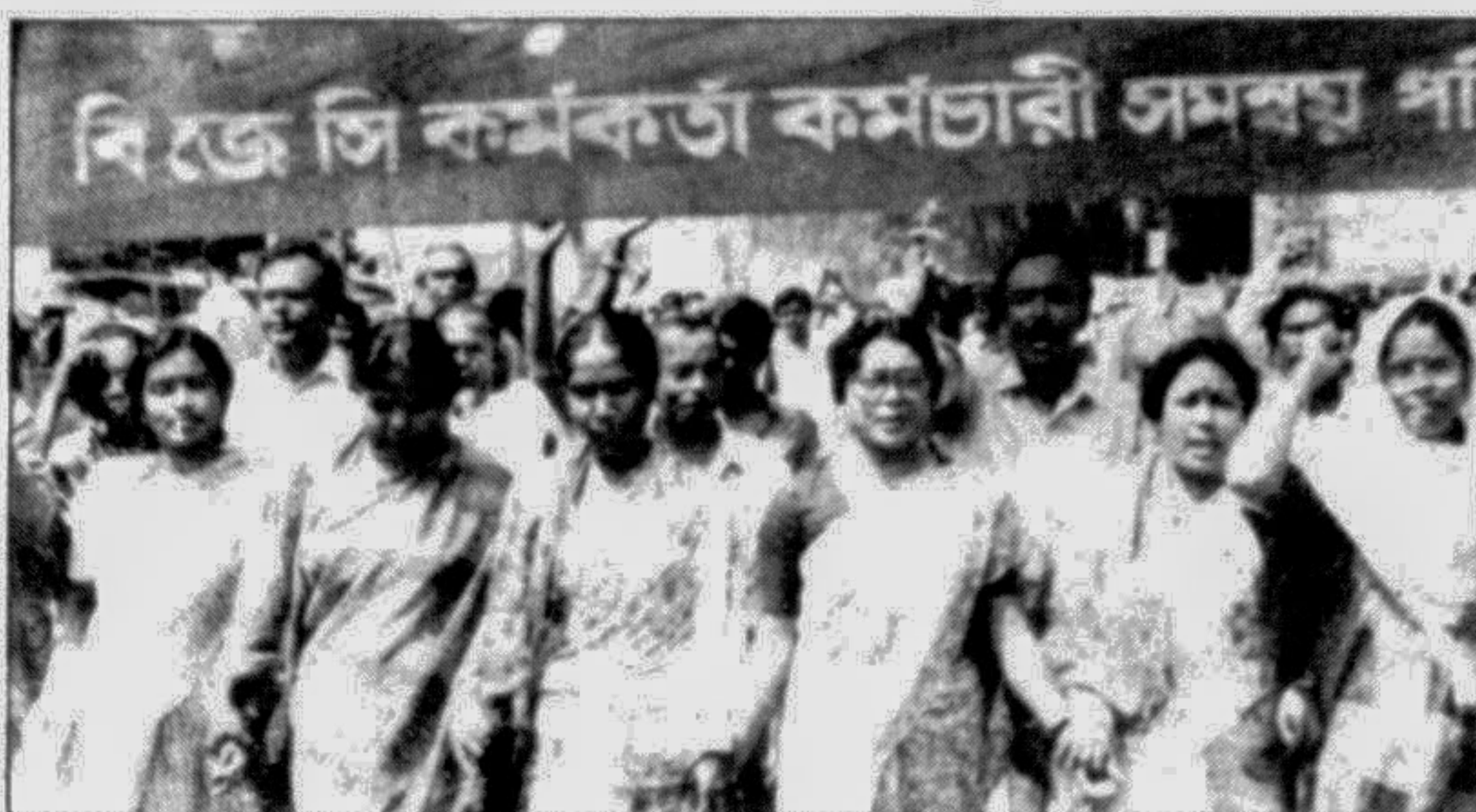
BJC Officers and Employees Coordination Council staged a rally yesterday in protest against retrenchment of workers.

Addressing the meeting, attended by senior officials of DESA, the Minister asked to maintain undisturbed power supply and improve the service. Electricity is a moving force for productivity and there is no alternative to improving and developing this sector, he added. The minister said the World Bank has recently withdrawn its ban on credit to the power sector in appreciation of a significant improvement.