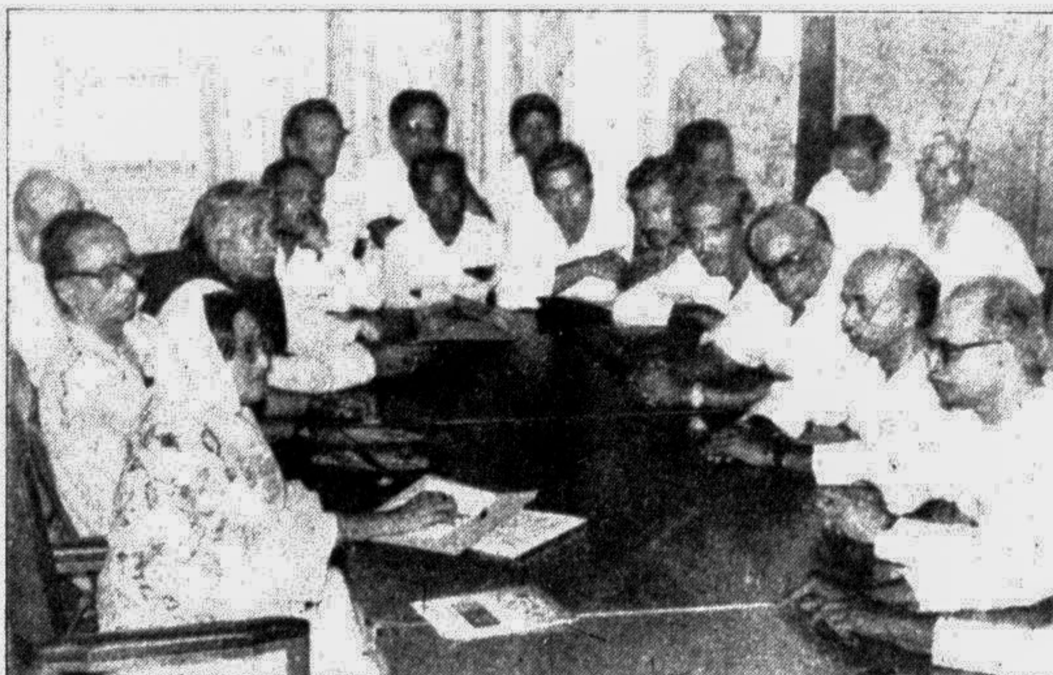
Leaders of Sramik Karmachari Oikya Parishad (SKOP) called on Leader of the Opposition in Parliament Sheikh Hasina at her Minto Road residence yesterday.

Most public opinion polls have indicated greater popularity for Yeltsin than the Congress.