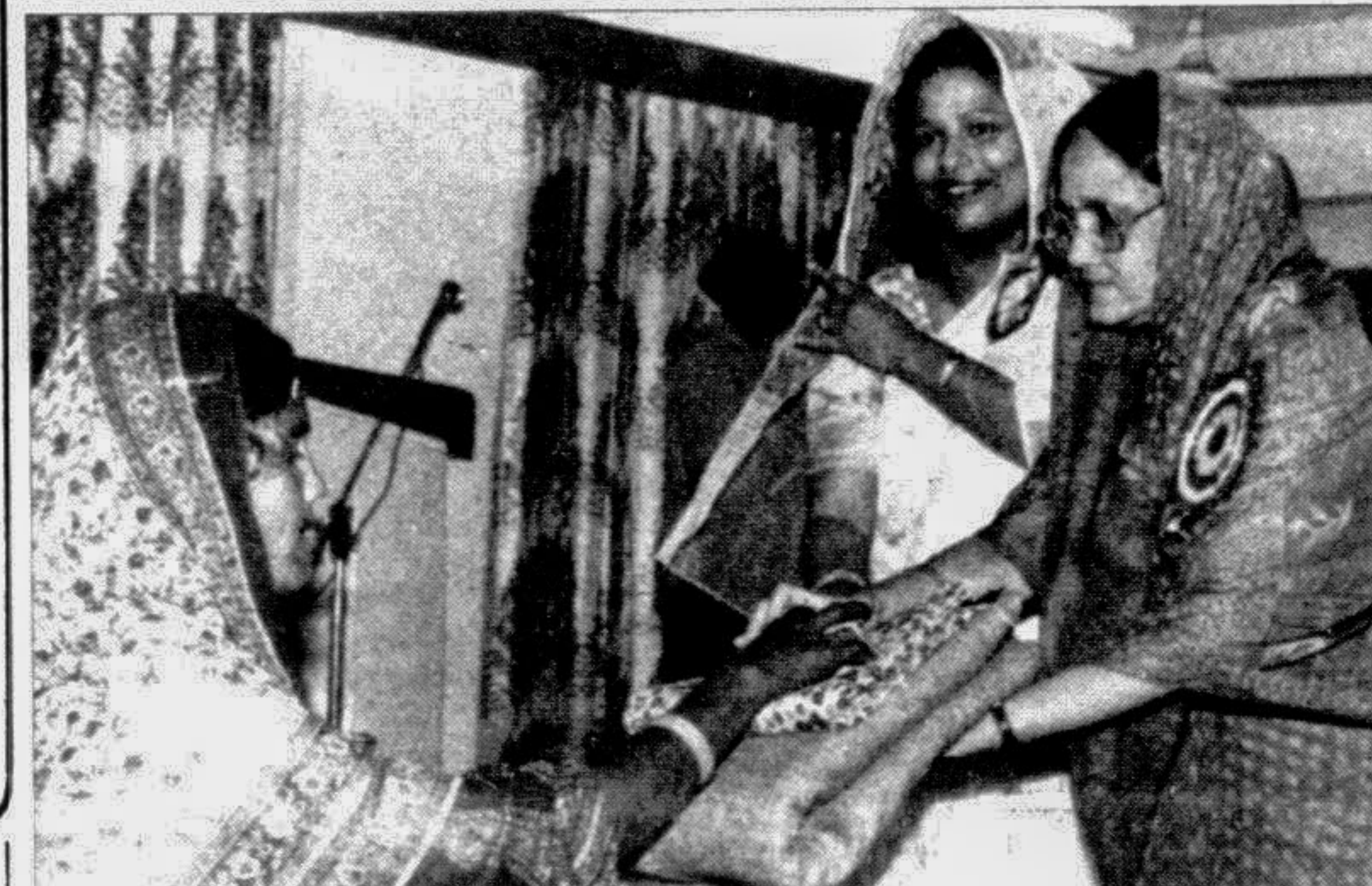
State Minister for Social Welfare and Women's Affairs Sarwari Rahman seen giving away zakat clothes to the poor deaf and mute at a function organised by the Dhaka Deaf Sports Association in its Bijoynagar office premises in the city yesterday.

The loss on account of the fire was estimated at over Taka one lakh.