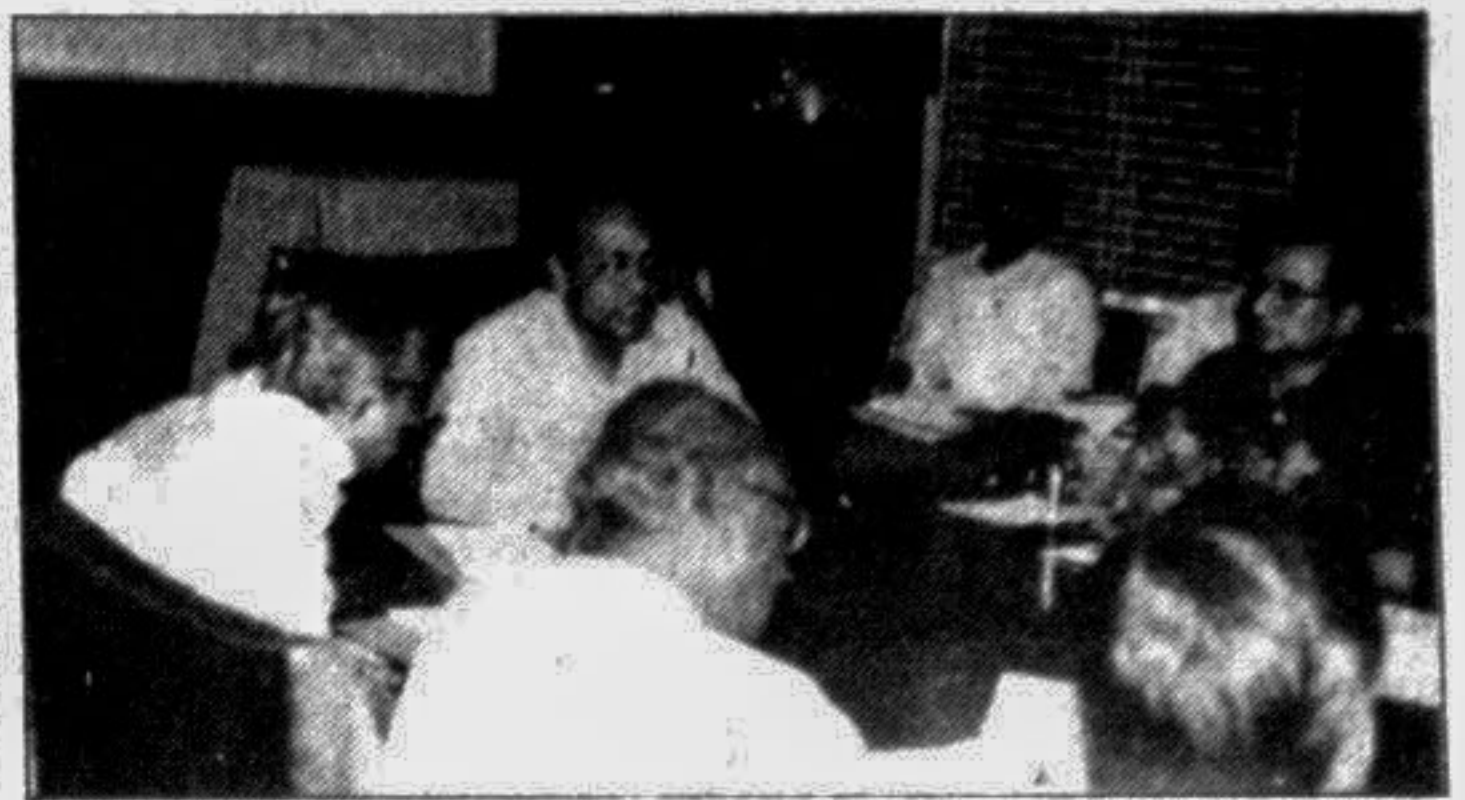
Minister for Energy and Mineral Resources Dr. Khandaker Mosharraf Hossain addressing the high officials of PDB at a review meeting on revenue collection at the WAPDA building yesterday.