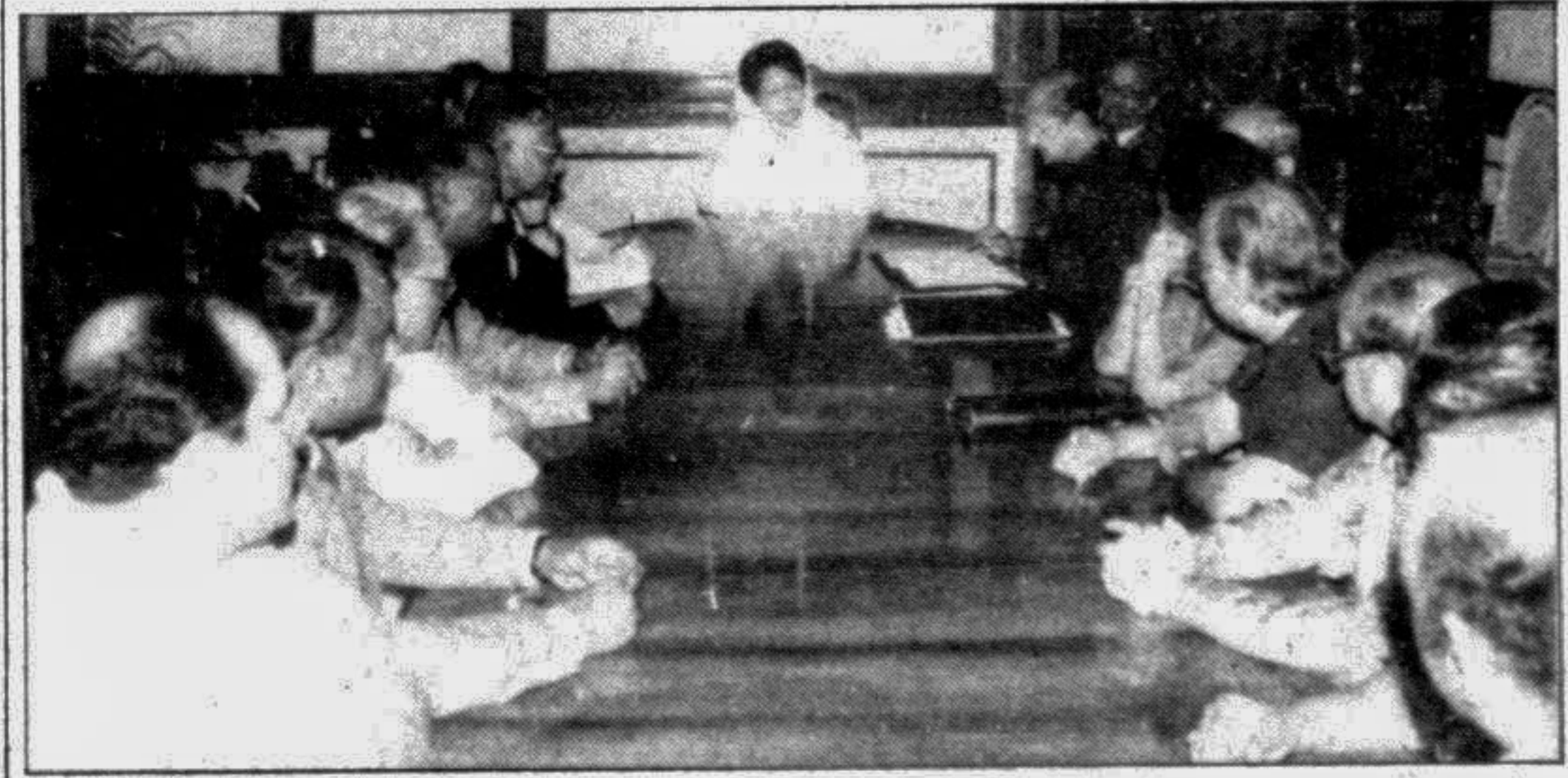
Leaders of Bangladesh Employers' Association called on Prime Minister Begum Khaleda Zia at her Sugandha office yesterday.