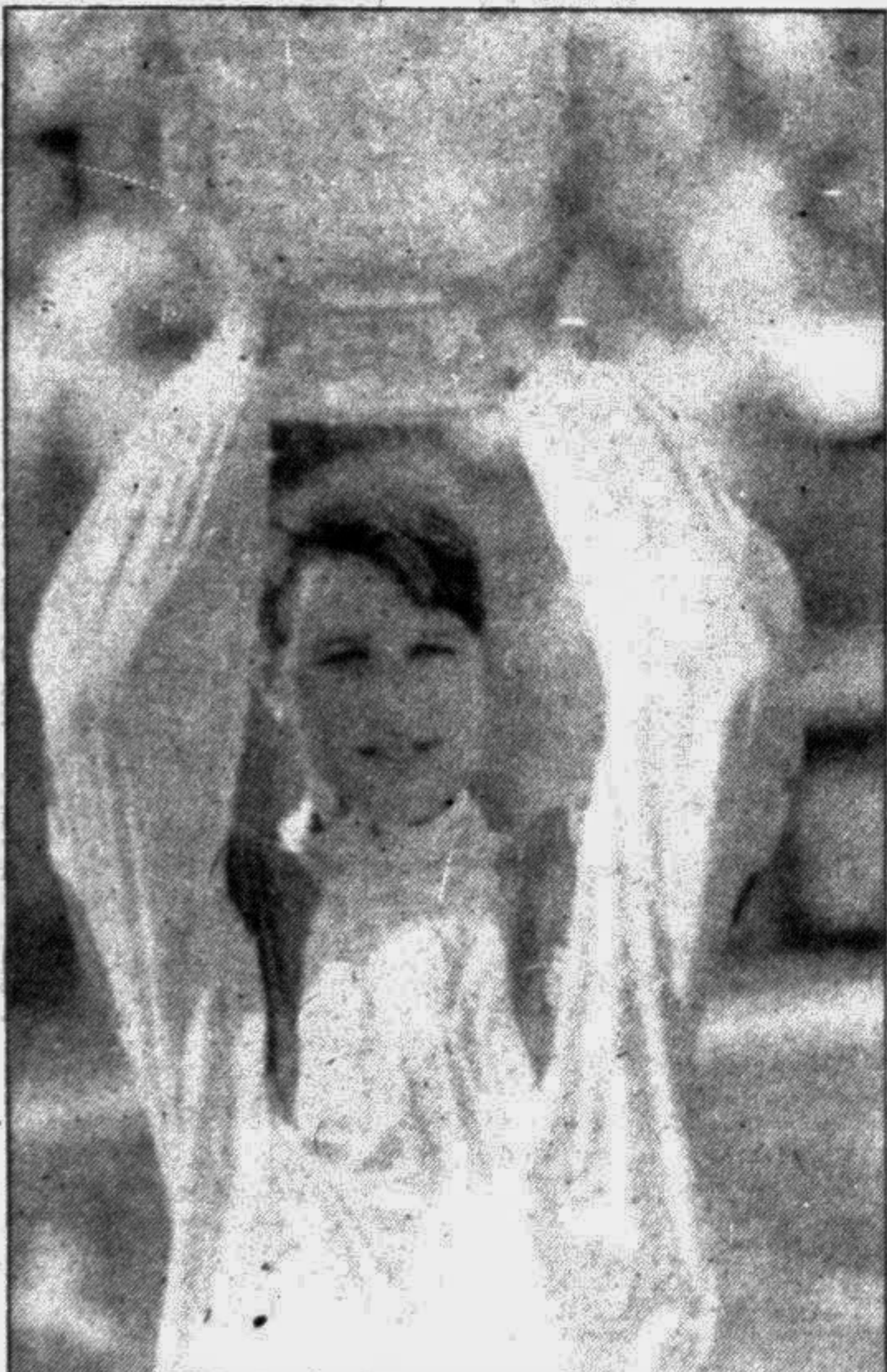
World number two Steffi Graf of Germany holds her Virginia Slims of Florida trophy after her final against Spaniard Arantxa Sanchez-Vicario at Delray Beach on Sunday. Graf won 6-4, 6-3.