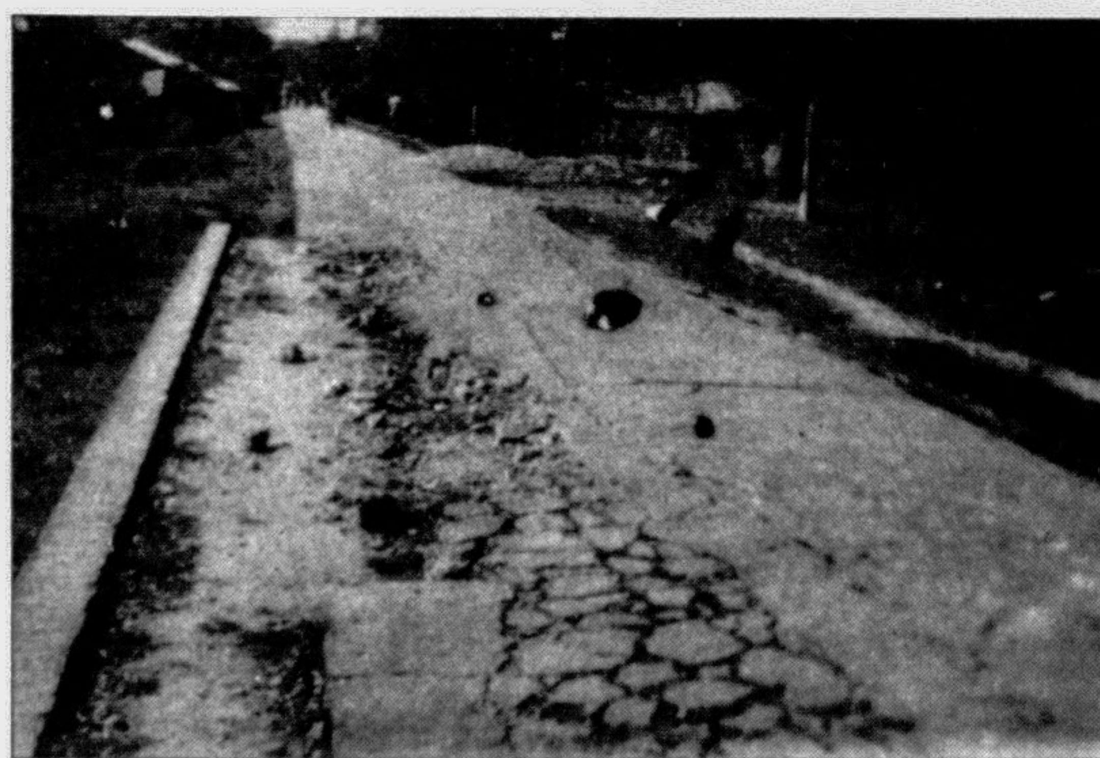
SYLHET: Pitiab condition of a road in the Hasnanagar area of Sunamganj town which needs immediate reconstruction.

PABNA, Mar 8: Huge quantity of electric goods were stolen from Pabna, Iswardi, Chatmohar and Kazinathpur electric godowns in the last 14 months, official sources said, reports UNB.