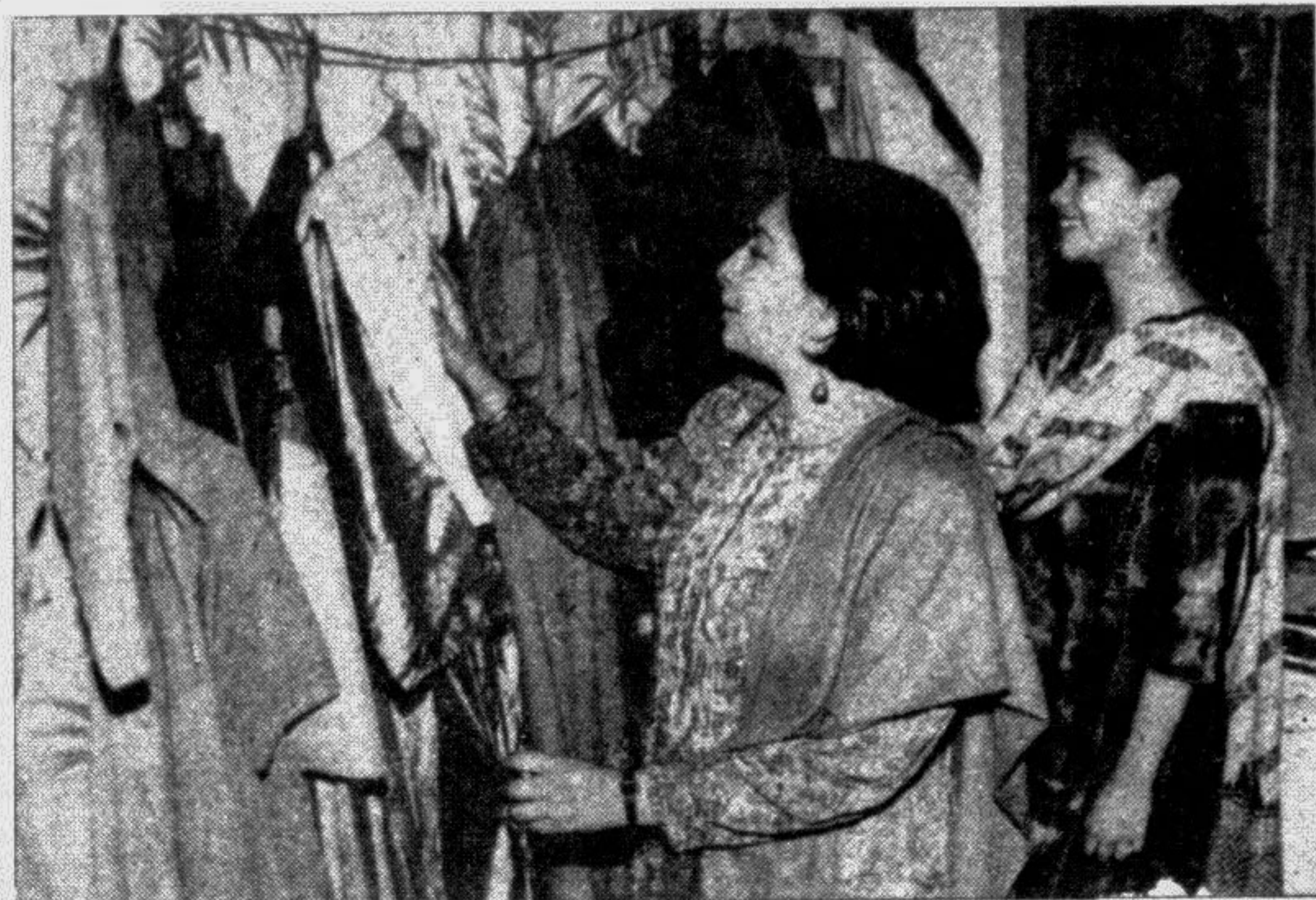
A scene from the "Sagittarius" clothes display.