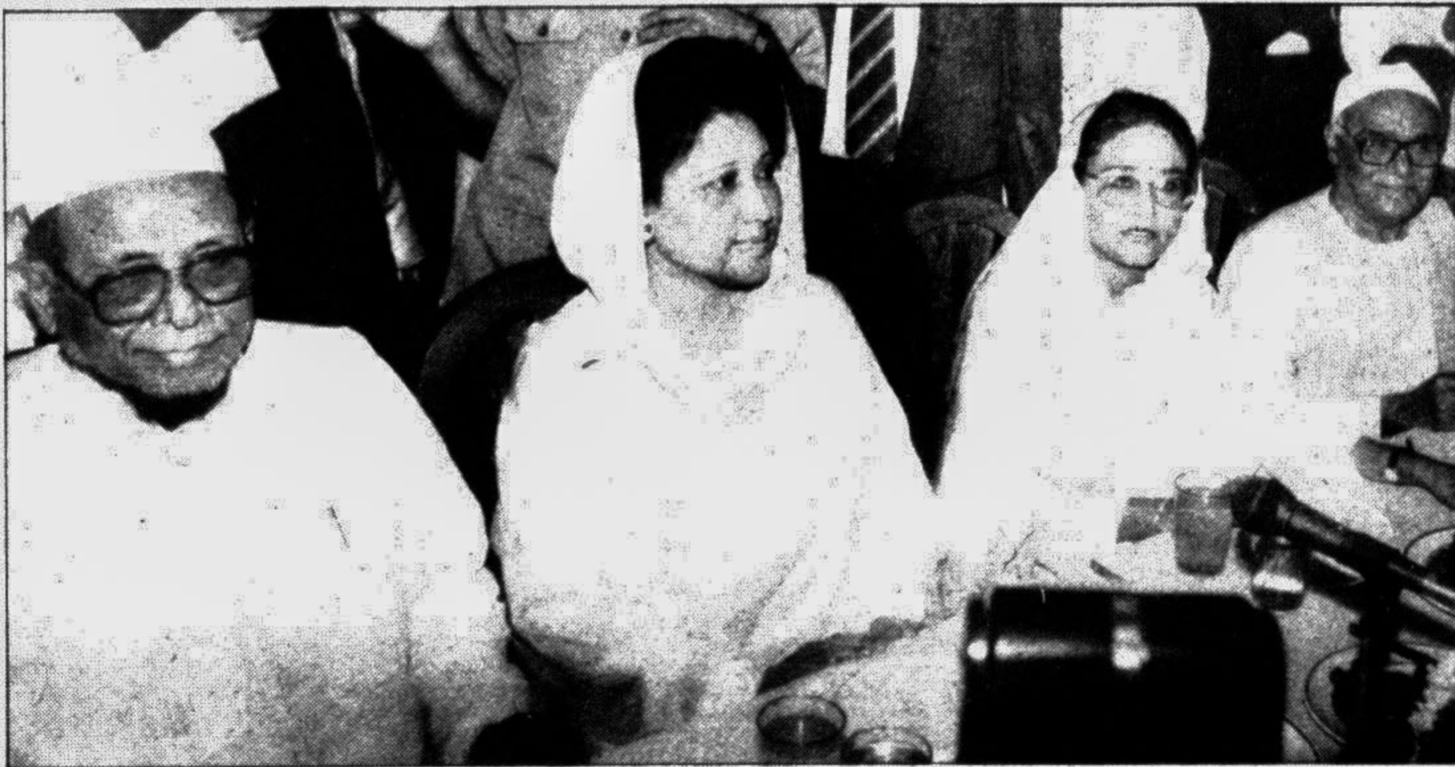
A MEETING WITH MANY MEANINGS: Prime Minister Begum Khaleda Zia and Leader of the Opposition in Parliament Sheikh Hasina flanked by Speaker Shaikh Razzak Ali (right) and Deputy Leader of the Opposition Abdus Samad Azad (left) at an iftar party hosted by the Leader of the Opposition at her Minto Road official residence yesterday.