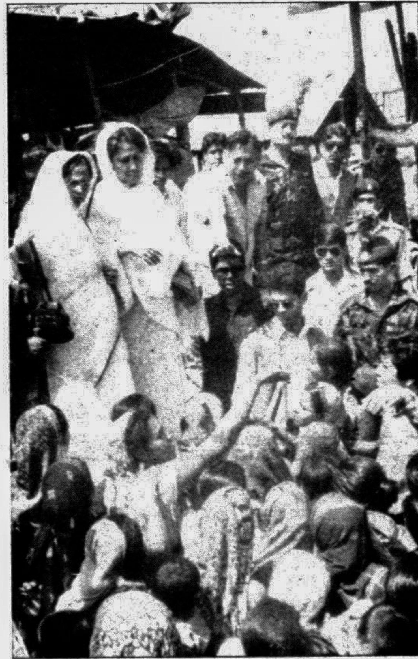
Prime Minister Begum Khaleda Zia talking to the Islambagh fire victims yesterday.