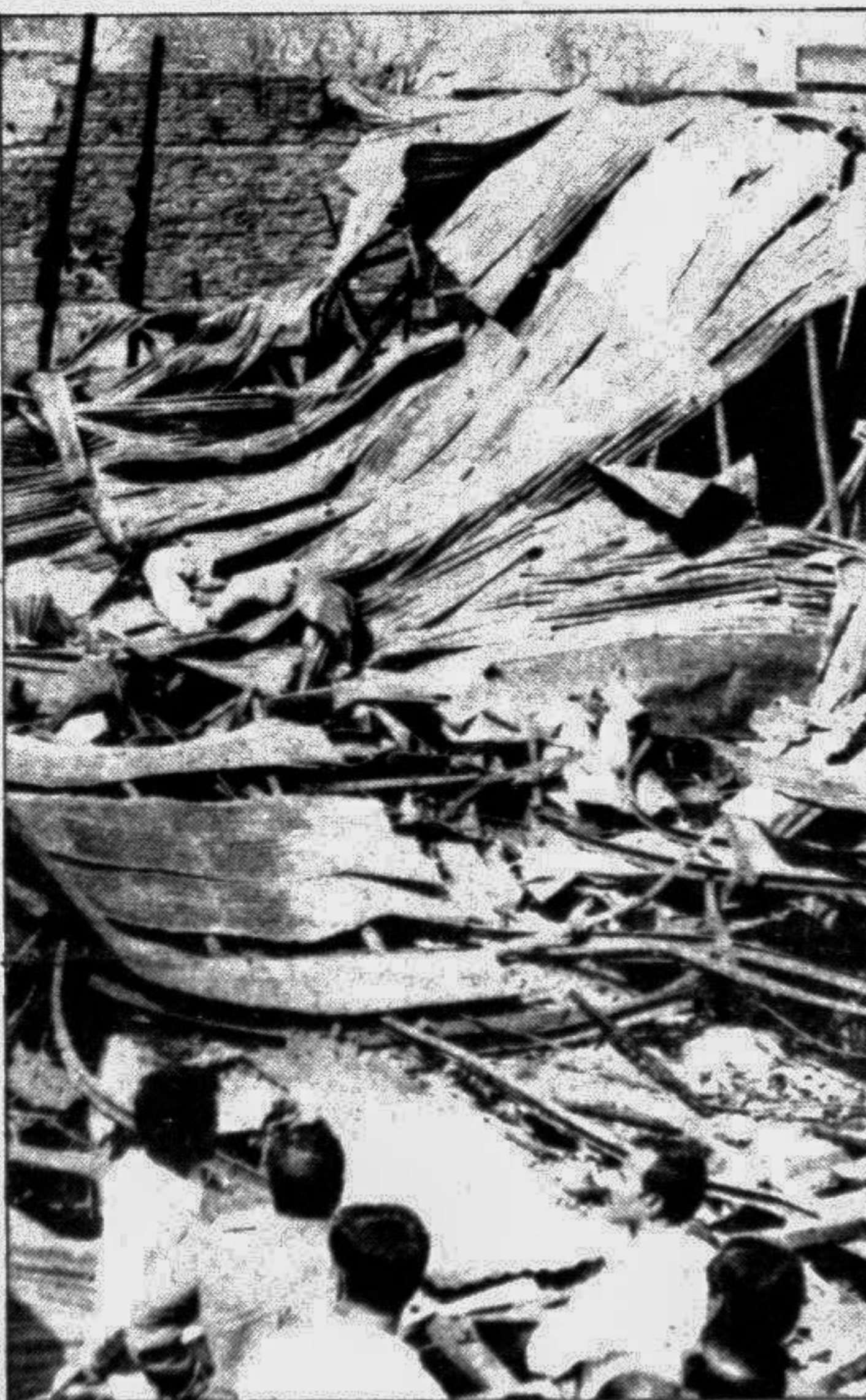
Ruins of Naz Cinema gutted by fire yesterday.

When he was reminded of the Wage Commission recommendations which were, according to the Memorandum of Understanding (MOU) signed between the government and the SKOP (Sramik See Page 12 Col 7