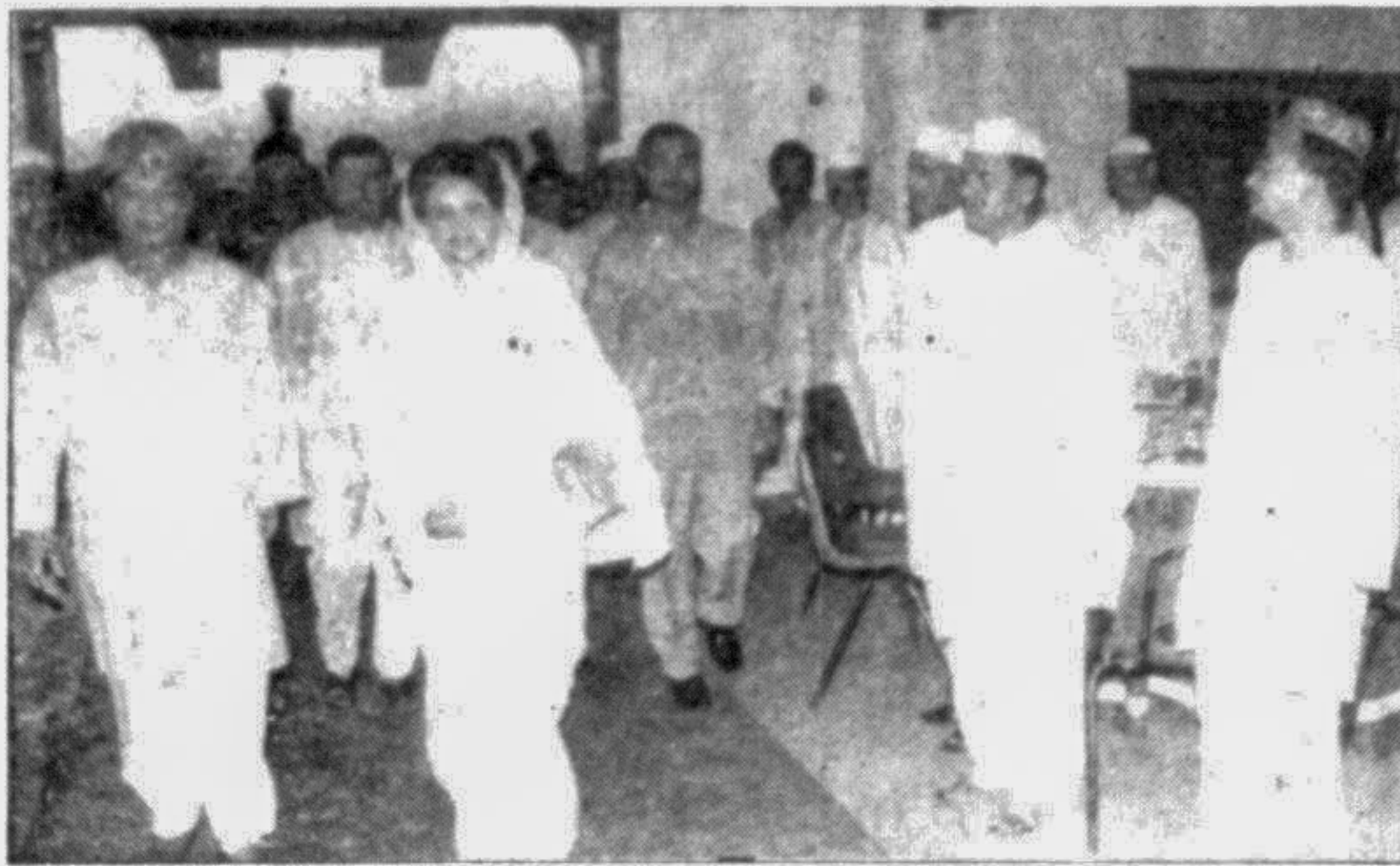
Prime Minister Begum Khaleda Zia attended an Iftar party hosted by the Bangladesh Air Force at Shenakunja yesterday.