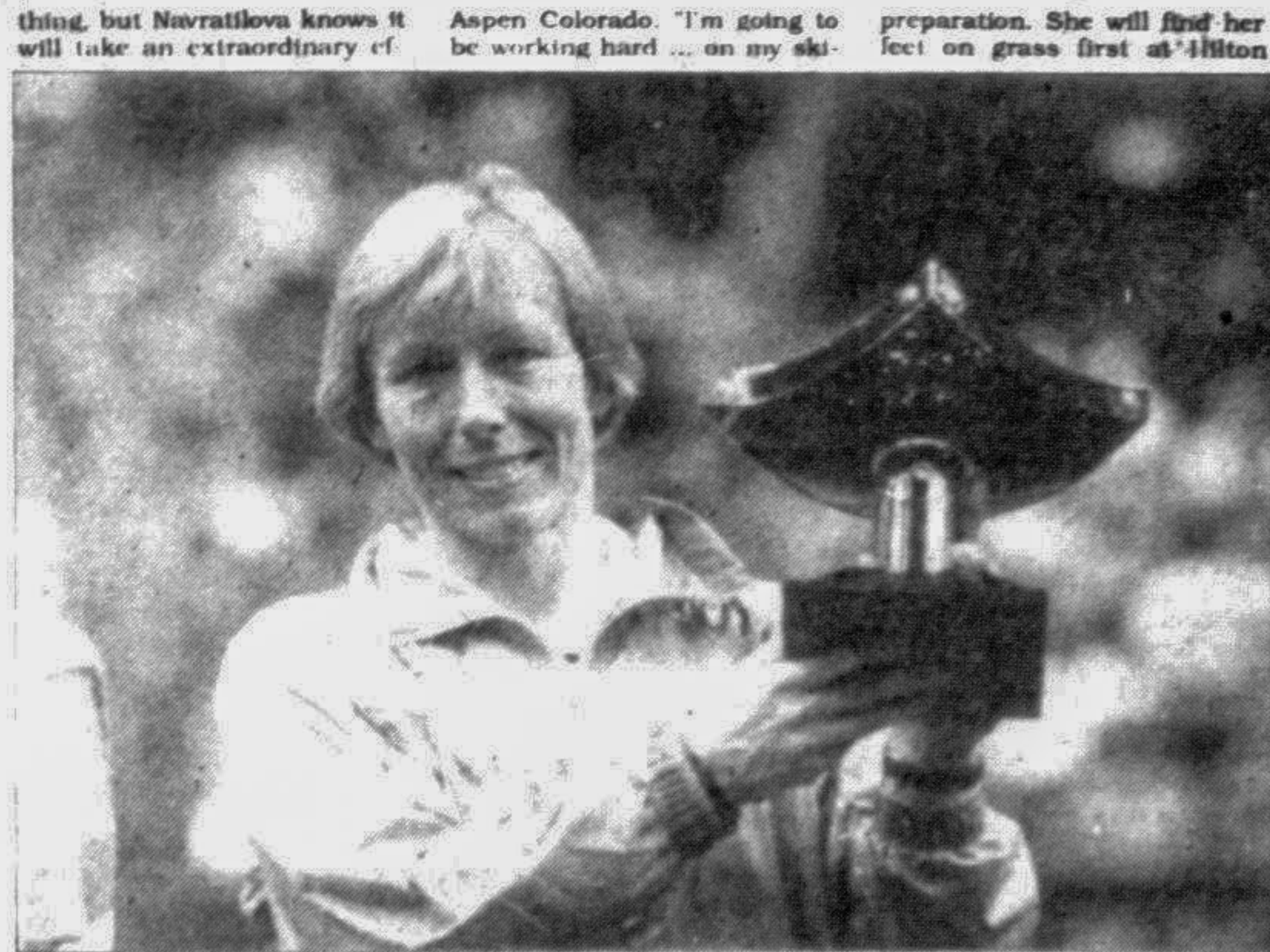
Czech-born naturalised American Martina Navratilova lifts the trophy after winning the Toray Pan Pacific open tennis tournament in this file photo taken on February 7, 1993 in Yokohama, Japan. It was Navratilova's 162nd career title.

fort to win her 19th Grand Slam tournament, equalling the haul of Helen Wills Moody and leaving her second only to Margaret Court. She was looking pretty good last year until Seles stopped her in the semi-finals. "That experience has made Navratilova guarded about predicting too much, but when asked about Wimbledon, it is clear she really believes she can win." "Since the US Open I've made the final of every tournament I've played," she says. "I've beaten them all: Seles, Graf, Sabatini and Sanchez. What I haven't done is beat them back-to-back and that's what makes the difference in the Grand Slams." A schedule designed with an eye on personal pleasure helps sustain her enthusiasm for the game. Paris completed a run of three continents in three weeks but that was exceptional. She is now enjoying five weeks off at her home base in