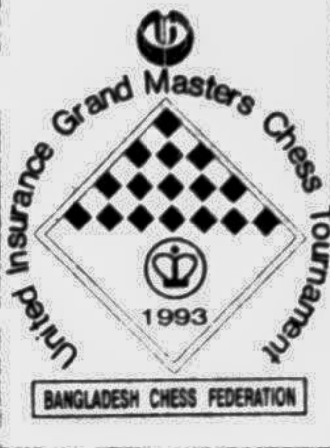
bin-Sattar stumbled in the tenth round of the United Insurance Grandmasters' chess tournament.