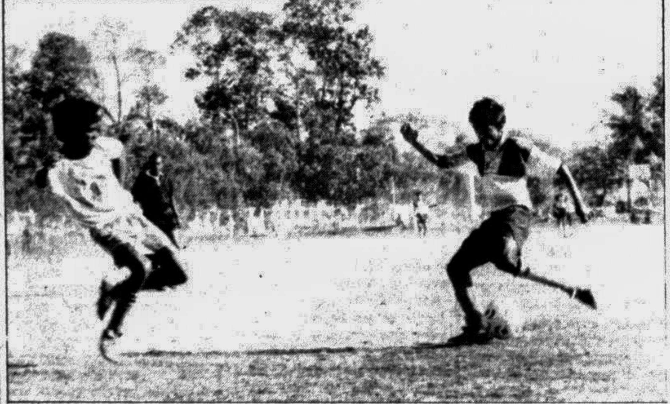
Action from yesterday's Pioneer league encounter between Arambagh KC and Amligola Tarun Sangha at the Outer Stadium. Amligola edged Arambagh by a solitary goal.