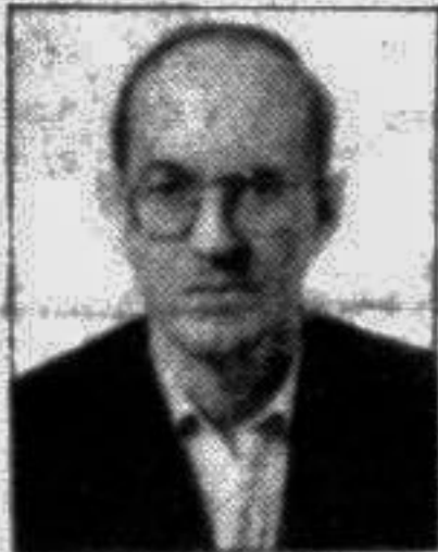
A reservoir of confidences Page 3