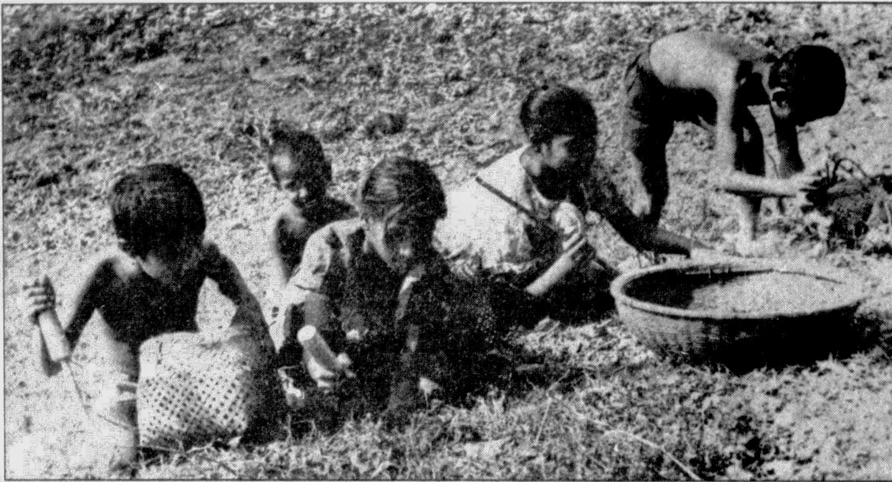
POPULAR SWEET POTATO: Harvesting season of sweet potato in village areas. Children are found plucking potatoes from ground.