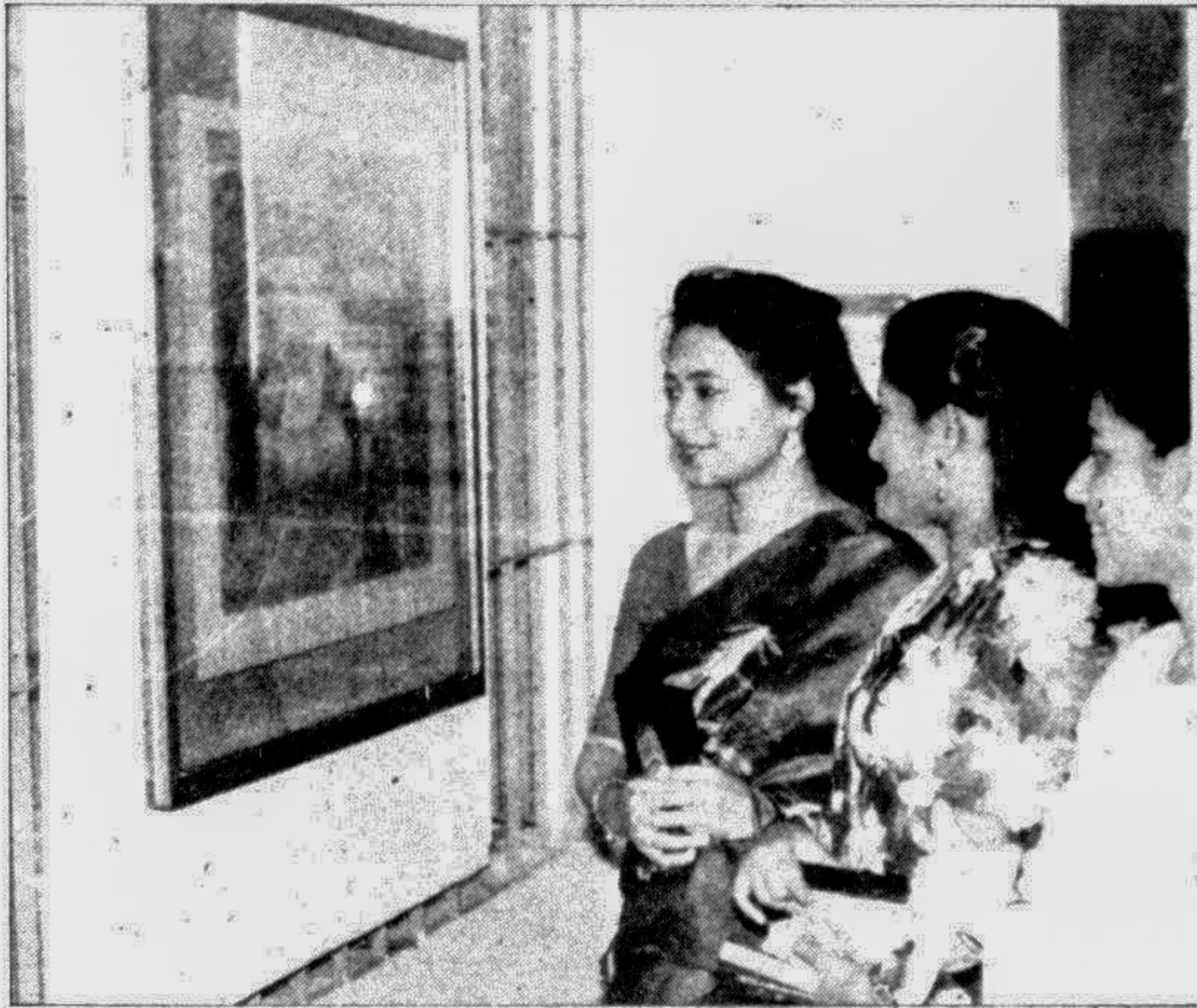
A three-week long workshop on Graphics prints and exhibition began at Shilpakala Academy yesterday.