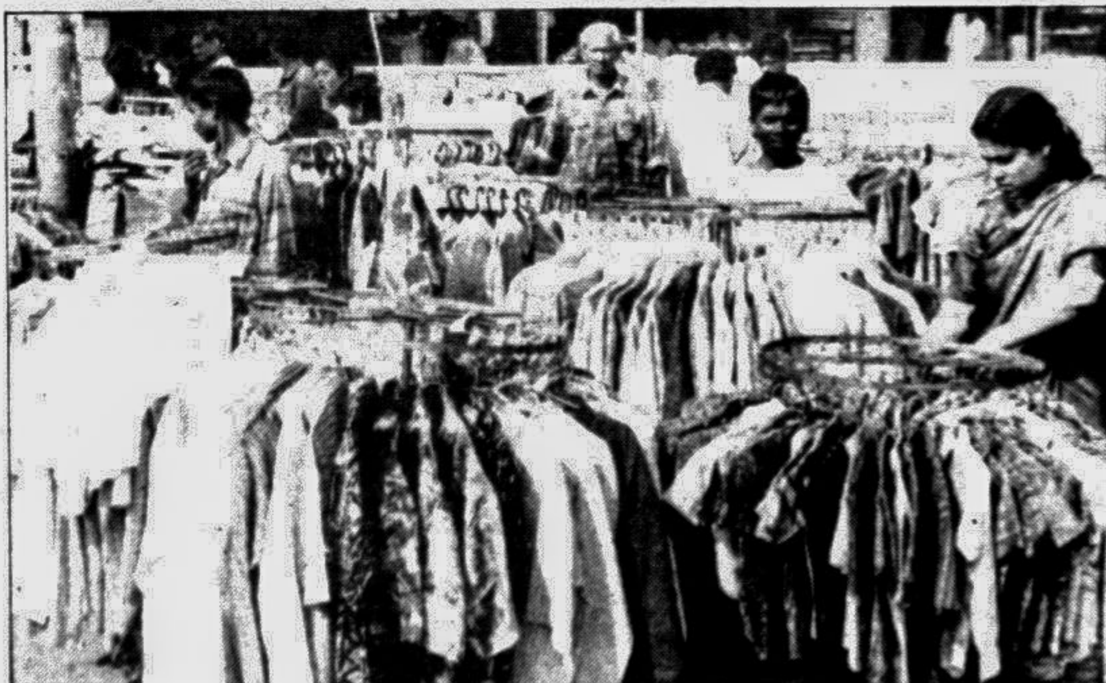
Unauthorised make-shift shops in front of Gausia Market on Mirpur road.