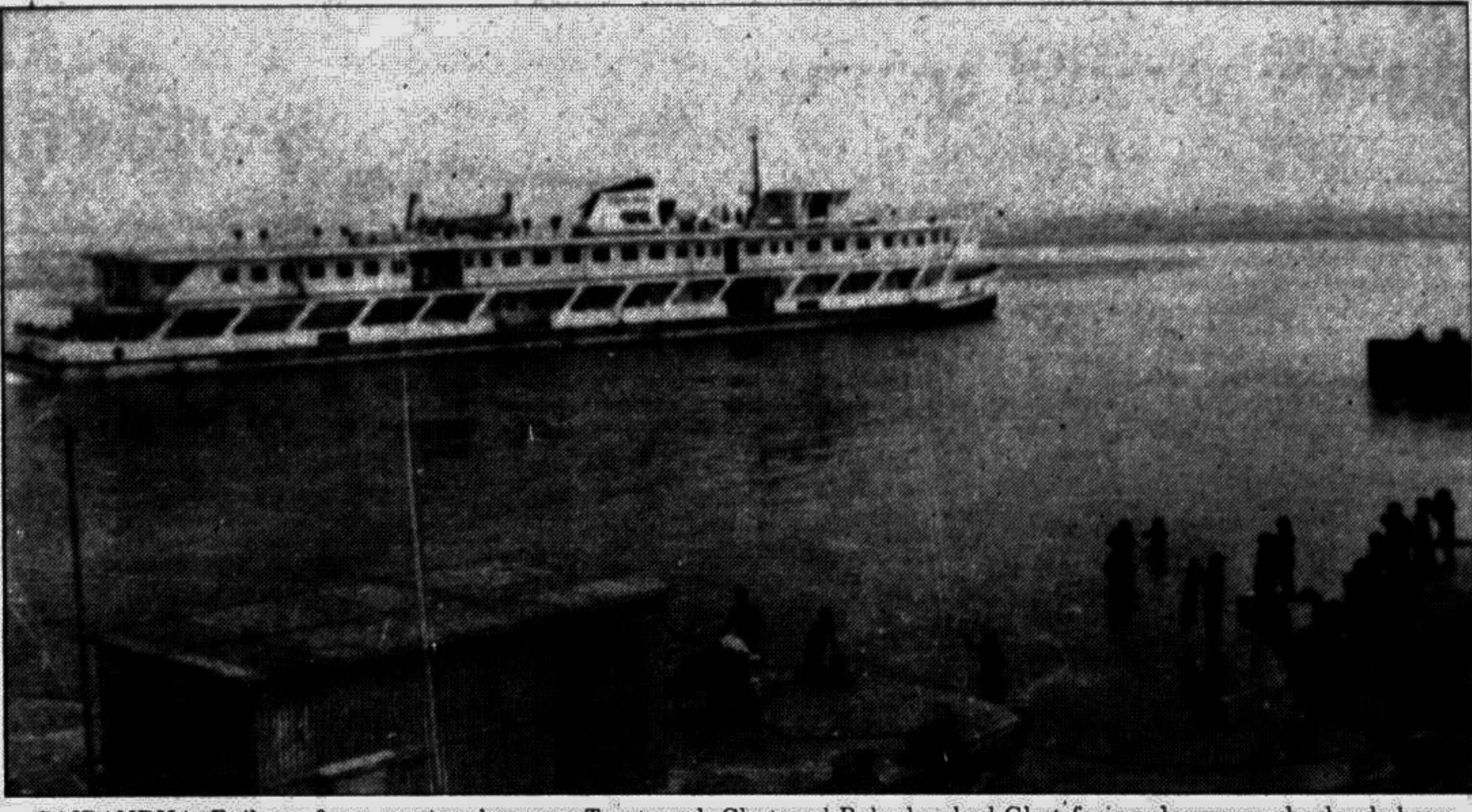
GAIBANDHA: Railway ferry services between Teestamuk Ghat and Bahadurabad Ghat facing closure as charlands have emerged at many points.