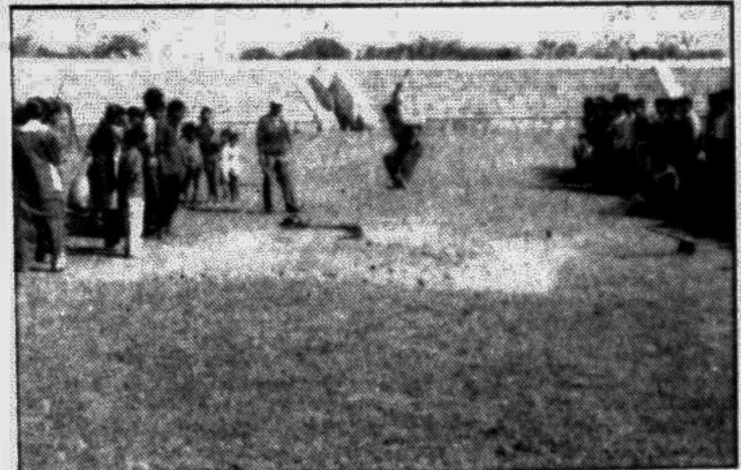
KURIGRAM: Girl participants are seen participating in long jump event of National School and Madrasah Kriya Protijogita-93 here recently at Kurigram.

The bus driver managed to flee the scene and a case was filed with Nabnagar police in this connection.