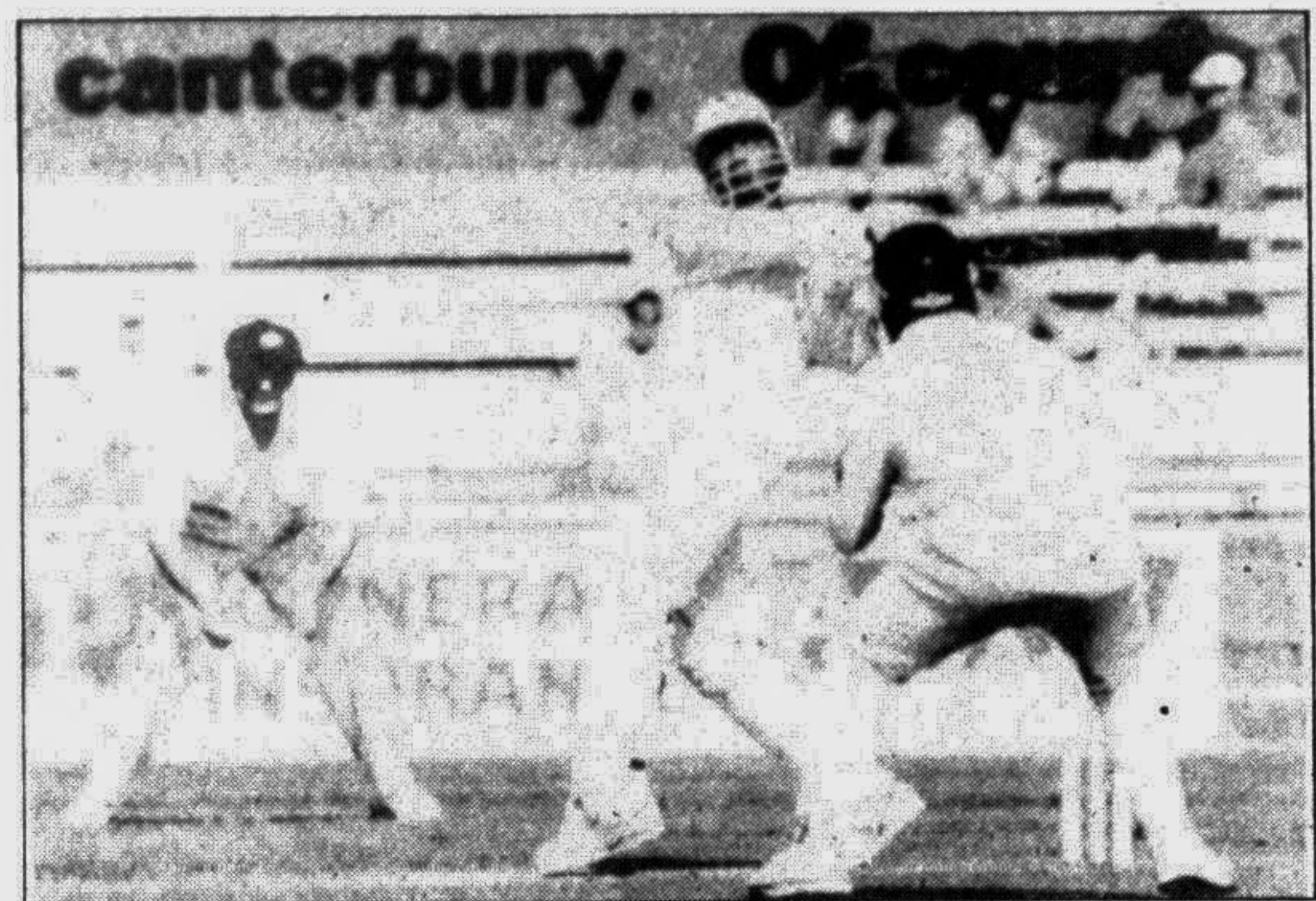
Kiwi allrounder Dipak Patel (c) mishits a Merv Hughes delivery to be caught by Craig McDermott during the third day's play of the first Test against Australia in Christchurch yesterday. The Kiwis are on the brink of an innings defeat.