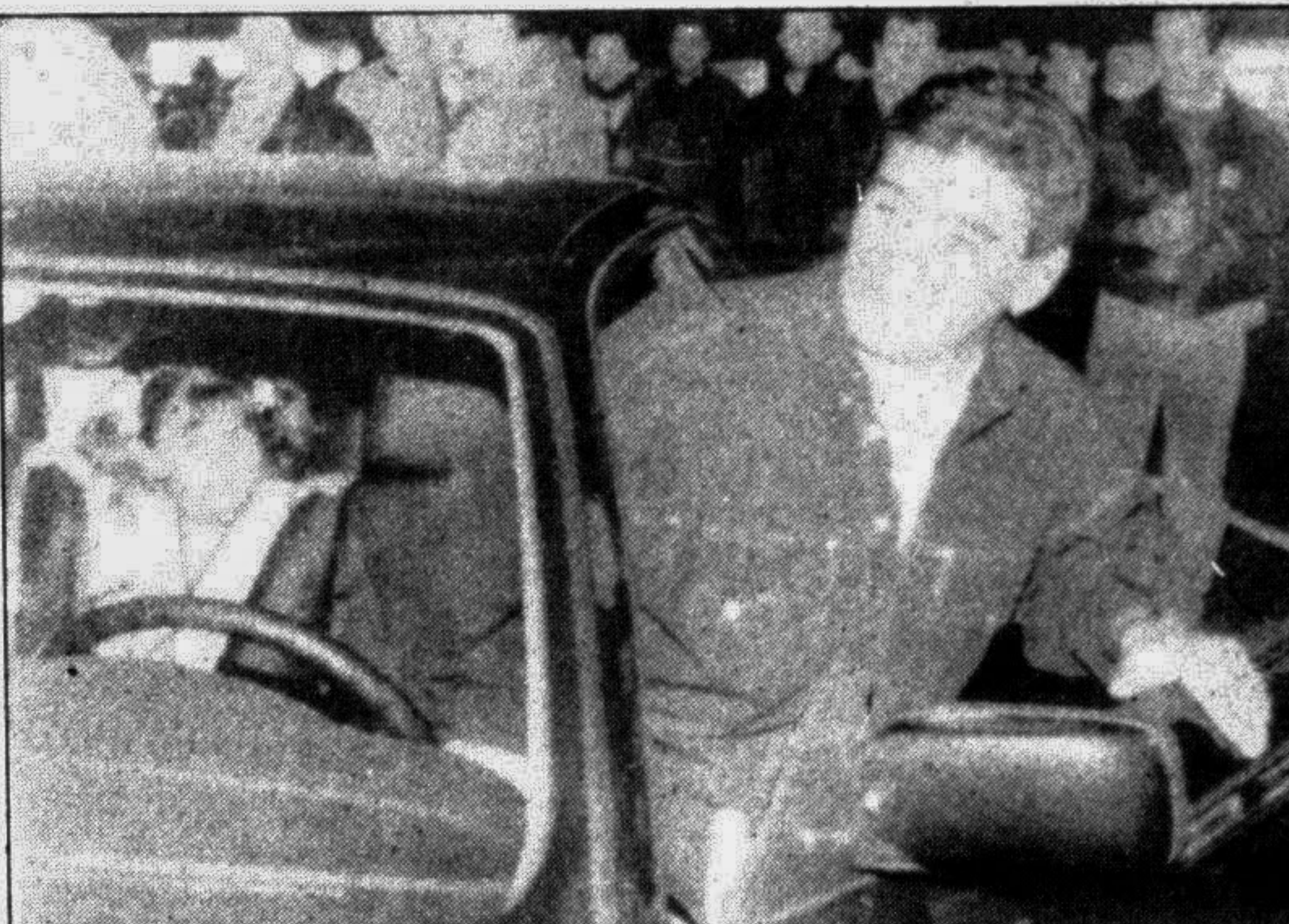
Argentine soccer idol Diego Maradona gets into his car with his daughter in the backseat at Seville airport, arriving from Buenos Aires on February 26 after playing for the Argentine national side on February 24. Maradona was fined 3 million pesetas for playing for Argentina without FC Sevilla's permission.

TOKYO, Feb 27: Japan's most famous soccer import, Britain's Gary Lineker, gave his support on Friday to Manchester's bid to host the Olympics in 2000, reports Reuter.