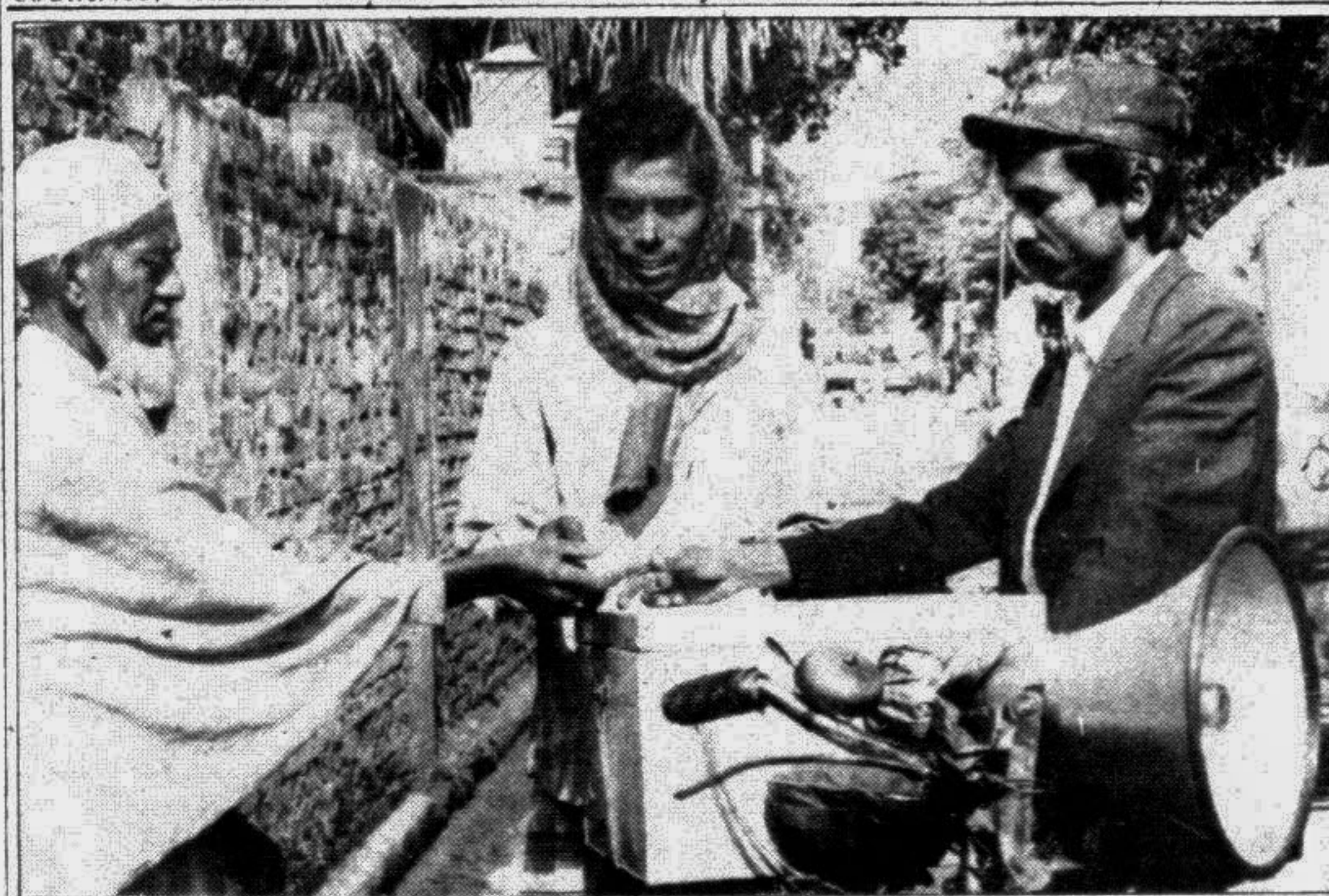
CHANGE IN PATTERN OF TRADING: Some hawkers now-a-days use microphone to attract buyers as there is a stiff competition among the traders.