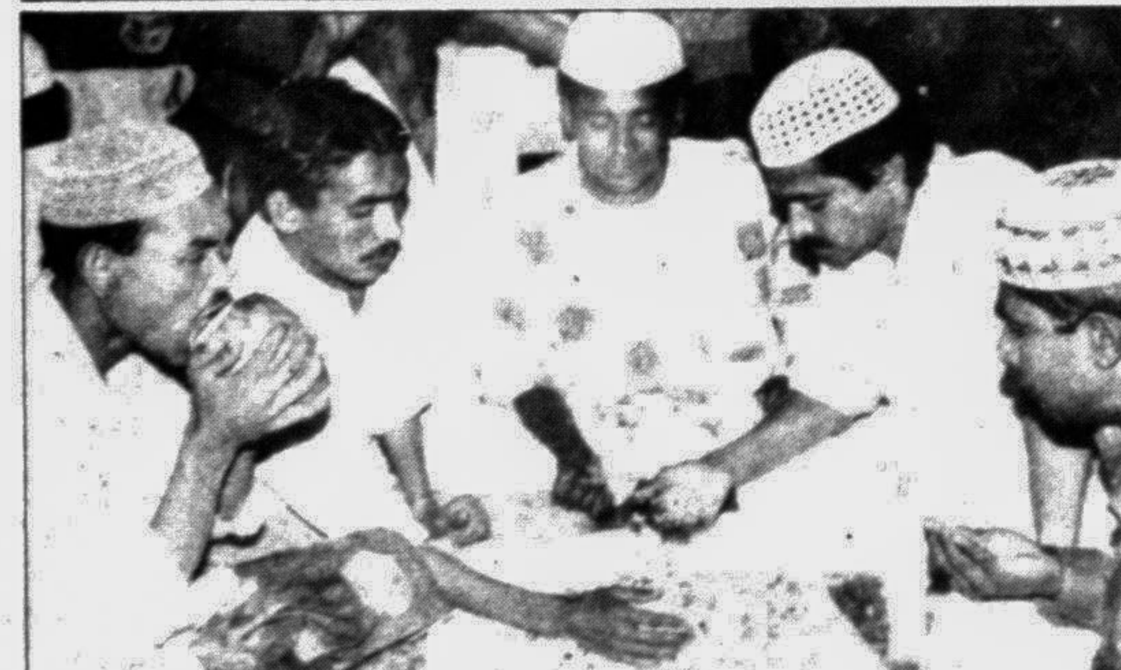
Muslims breaking fast in city yesterday.