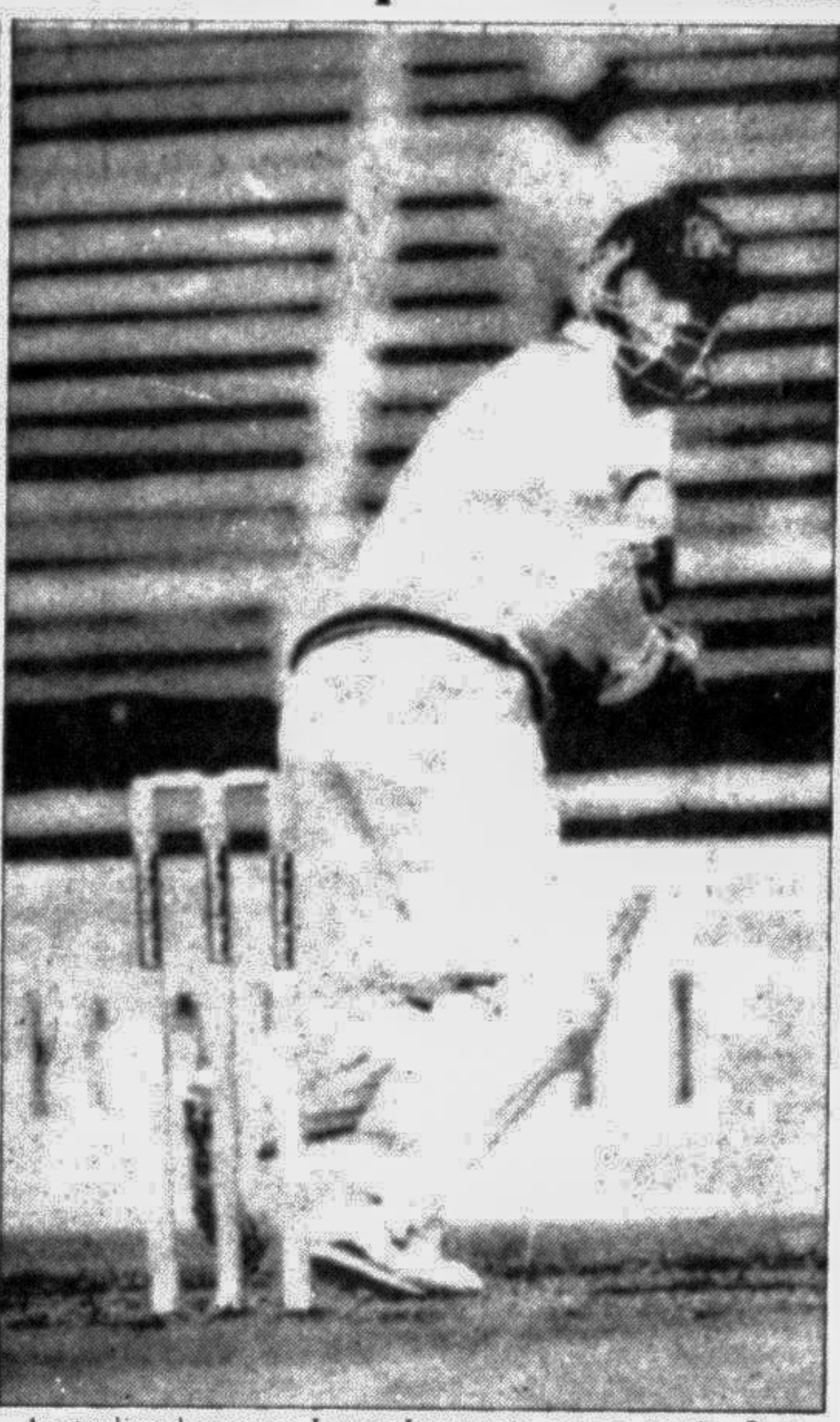
Australian batsman Justin Langer in action on the first day of the first cricket Test between Australia and New Zealand in Christchurch yesterday. Langer finished the day 63 not out.

GULSHAN WIN Meanwhile, all other clubs barring Abahani and Mohammedan have finished their first phase engagements with the penultimate being played between Gulshan Youth and Surja Tarun Club at the Dhanmondi Cricket Stadium yesterday.