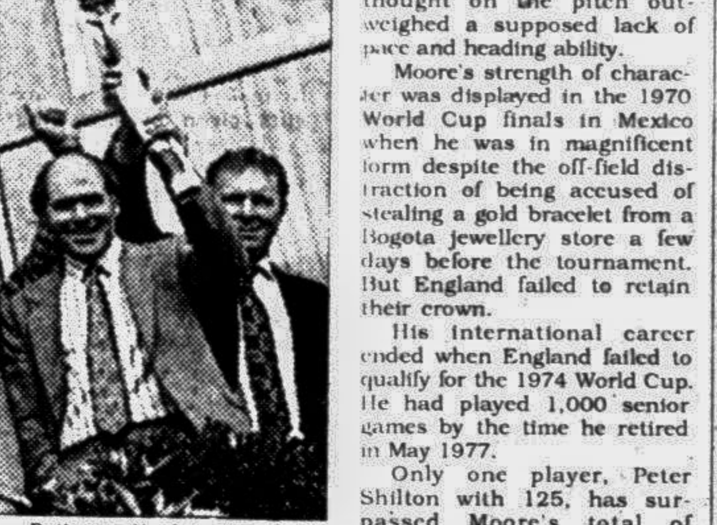
Daily Star file photo shows Bobby Moore (R) with 1966 World Cup-winning teammate John Conner (holding Cup replica) during Silver Jubilee celebrations of England's famous win on Oct 21, 1966.

LONDON, Feb 25: Bobby Moore, who died on Wednesday after a two-year battle against cancer, was not only England's finest soccer captain but was revered for epitomising a spirit cherished in leaders of sport, reports Reuter.