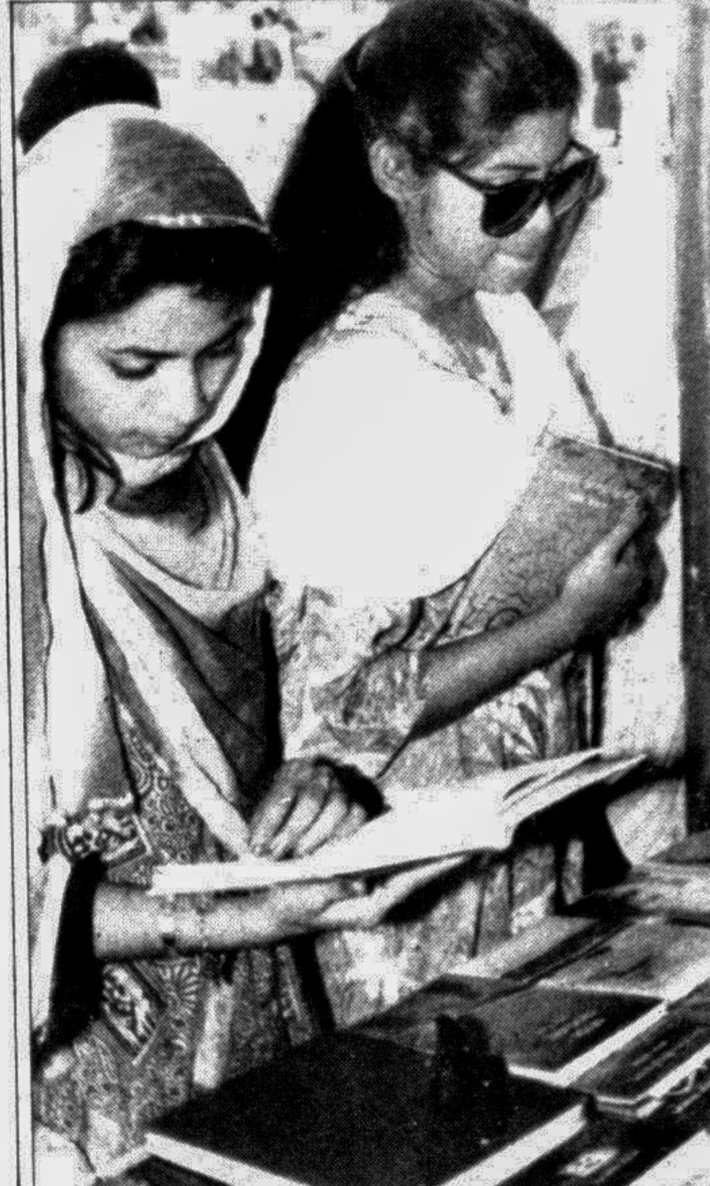
Bangla Academy book fair now going on at its premises to be concluded on February 28.