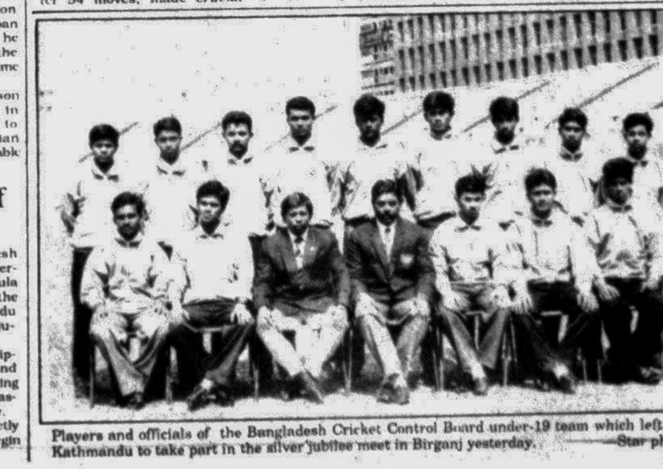
Players and officials of the Bangladesh Cricket Control Board under-19 team which left for Kathmandu to take part in the silver jubilee meet in Birganj yesterday.

opened with his customary g3 and accepted a draw after 35 moves.