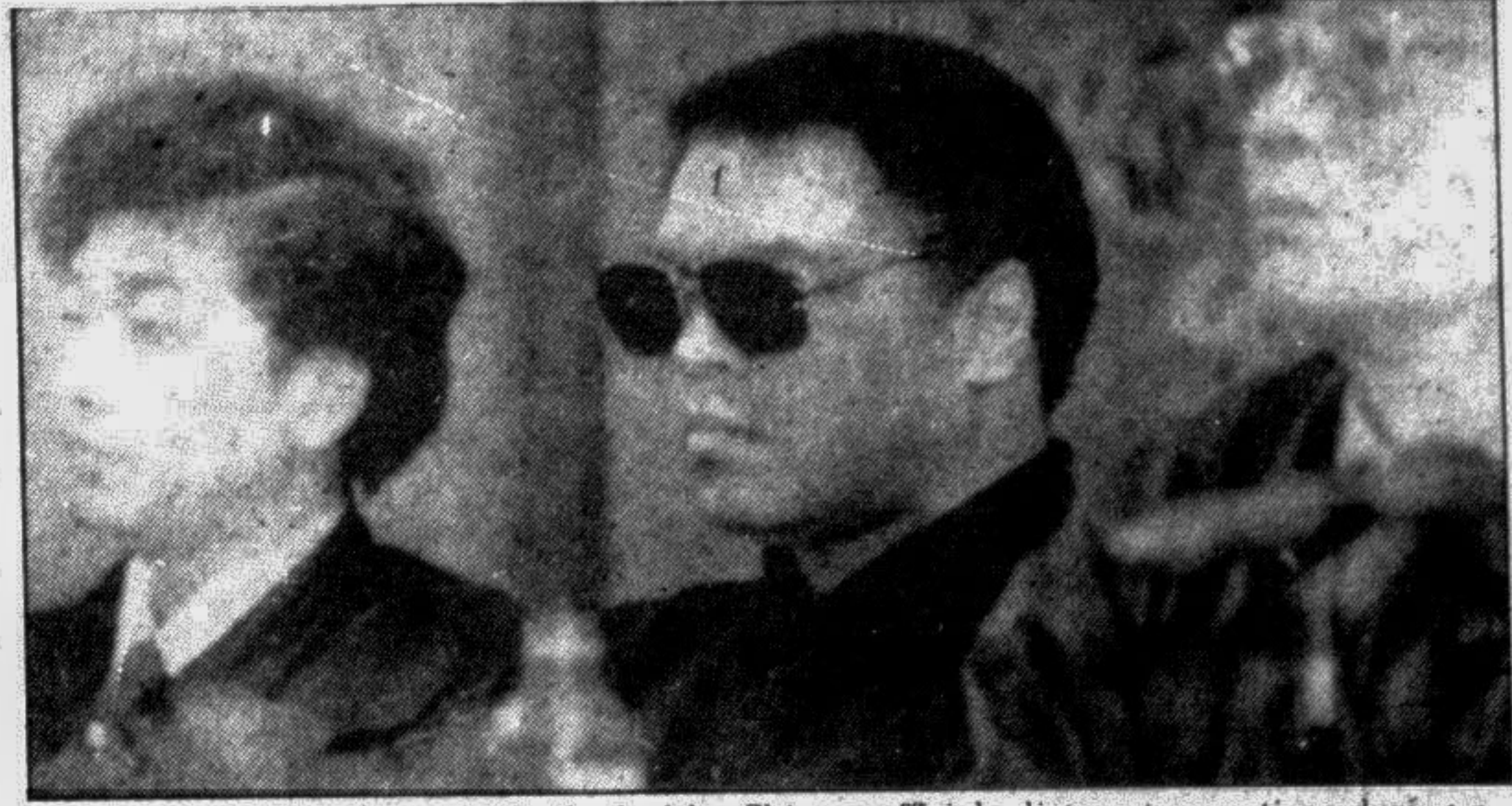
Boxing legend Mohammad Ali, flanked by Chinese officials, listens to questions during a press conference in Beijing yesterday. Ali is in Beijing on the occasion of the first professional boxing bout in the People's Republic of China.

Bangladesh, placed directly in the quarterfinals, will begin their campaign tomorrow.