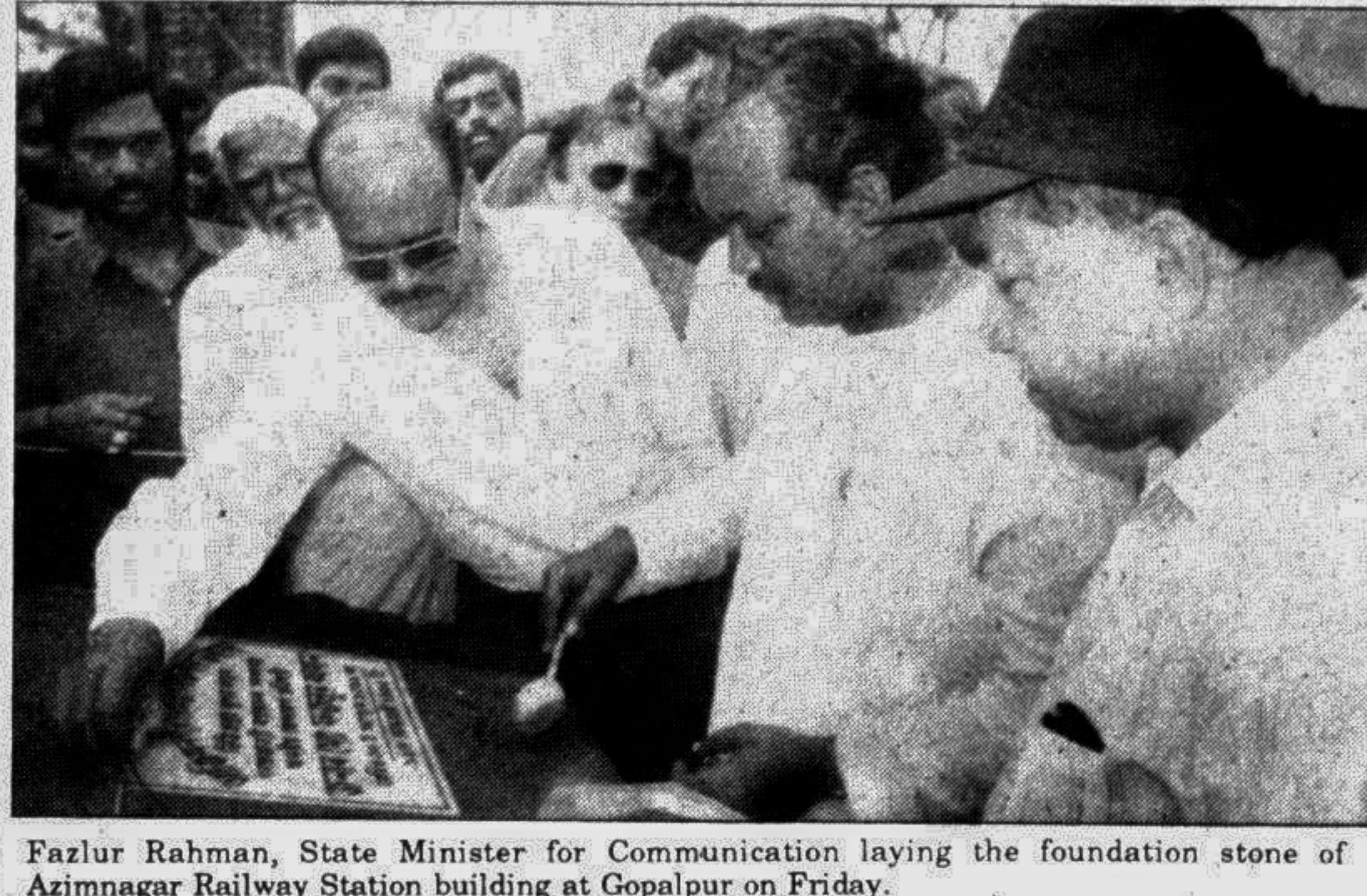
Fazlur Rahman, State Minister for Communication laying the foundation stone of Azimnagar Railway Station building at Gopalpur on Friday.

Feb 22: A total of 1,796.7 metric tons of wheat has been distributed among the members of 9,579 distressed families in ten thanas including Barisal Paurashava of Barisal district during the first six months of the current fiscal year, reports BSS.