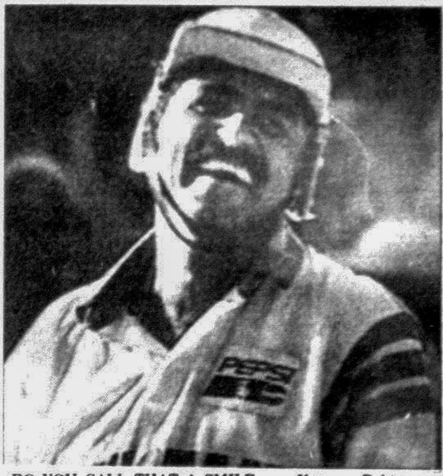
DO YOU CALL THAT A SMILE... Veteran Pakistan batsman Javed Miandad trying to hide his frustration with a smile as he watches last man Aaqib Javed coming in to bat in the one-day international against the West Indies on Friday. Miandad hung around for quite some time but found no support from his teammates as the world champions crashed to a 124-run defeat.

JOHANNESBURG, Feb 20: South Africa's cricketers, twice battered into submission by the Pakistani pace attack, plan to fight fire with fire for the team's vital one-day international near Pretoria on Sunday, reports AFP.