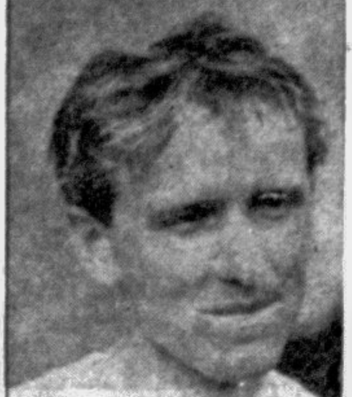
ALLAN DONALD Johannesburg in the event of all the teams being equal on points.

Fast bowler Fanie de Villiers returns to his home ground in a beefed-up South African pace attack that will aim to exploit a Pakistani batting line up humbled by a 124-run defeat by the West Indies in Durban on Friday. The South Africans hope that the recall to national duty of fast bowler Richard Snell will help cancel out the threat of Pakistan speed duo Waqar Younis and Wasim Akram. Sunday's match is a vital one, as the three teams are in a dead heat, having each played four matches, winning two and losing two - Pakistan have beaten South Africa twice, South Africa have beaten the West Indies twice, and the West Indies have beaten Pakistan twice. They all play each other one more time this week. There is a complex procedure for deciding who gets to next Saturday's final in