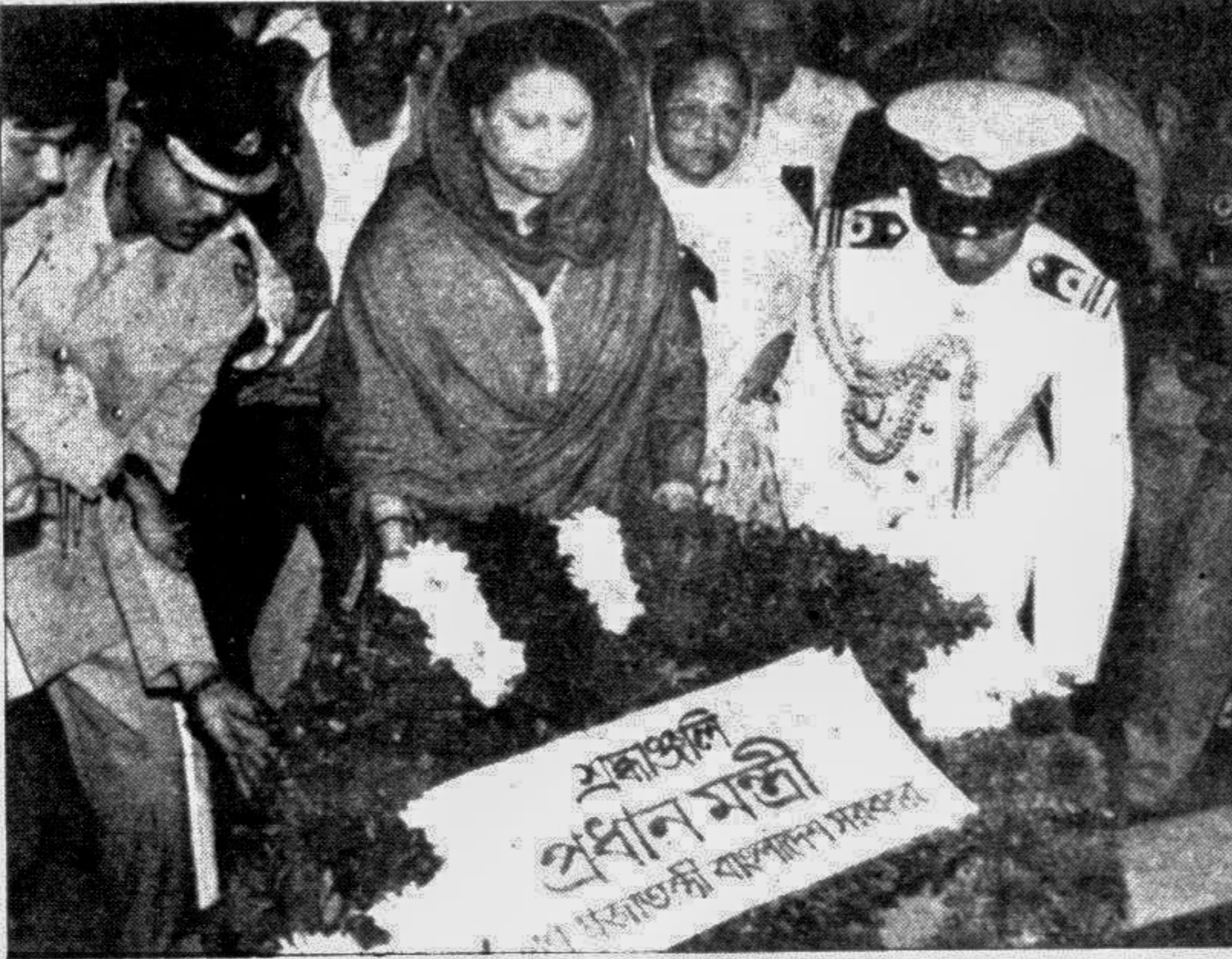
Prime Minister Begum Khaleda Zia placing wreath at the Central Shaheed Minar one minute past midnight Saturday.