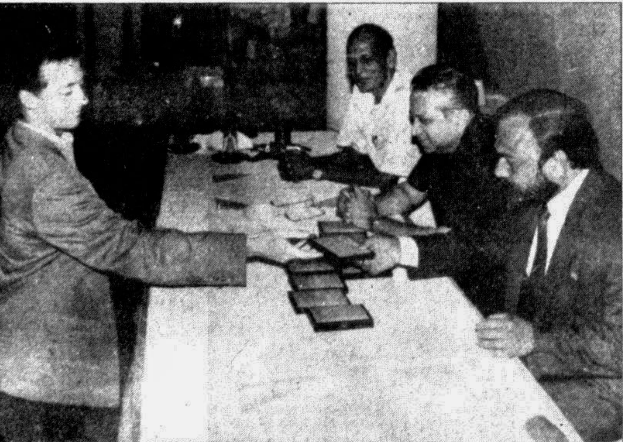
State Minister for Youth and Sports Sadek Hossain Khoka conducted the number-drawing for the first United Insurance GM chess championship at a local hotel yesterday. The meet begins this afternoon.

State Minister for Civil Aviation and Tourism A Mannan will witness the final as chief guest and give away the prizes.