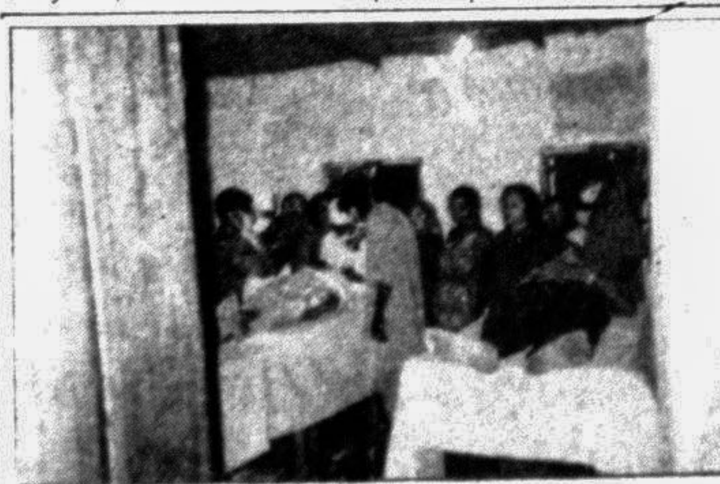
Lioness Club of Dhaka organised a Friday clinic yesterday at Bikrampur Kalma thana.