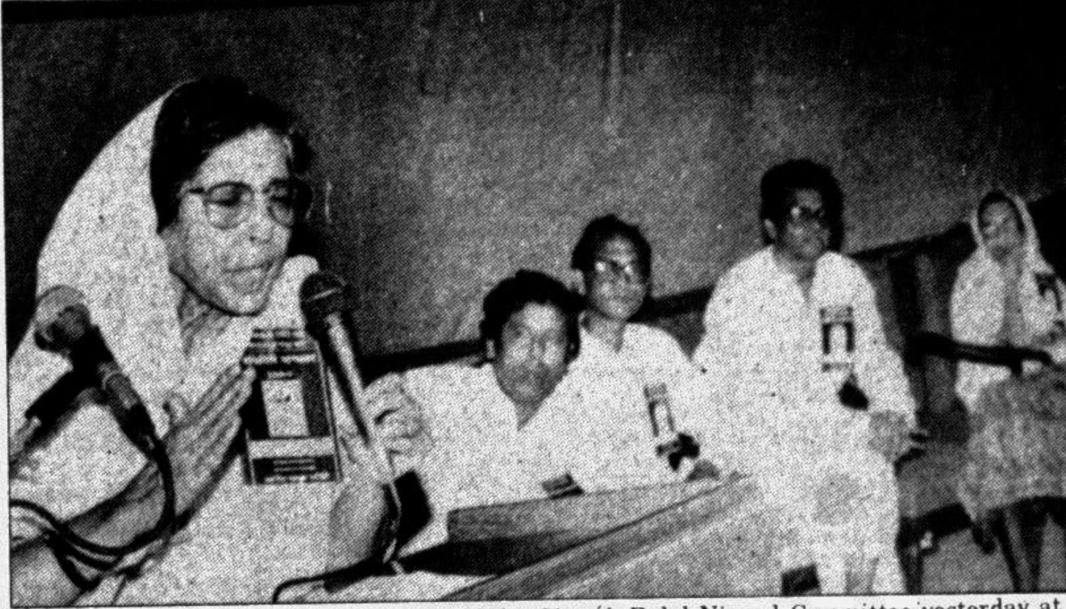
Jahanara Imam addressing a meeting of the Ghatik Dalal Nirmul Committee yesterday at TSC auditorium.