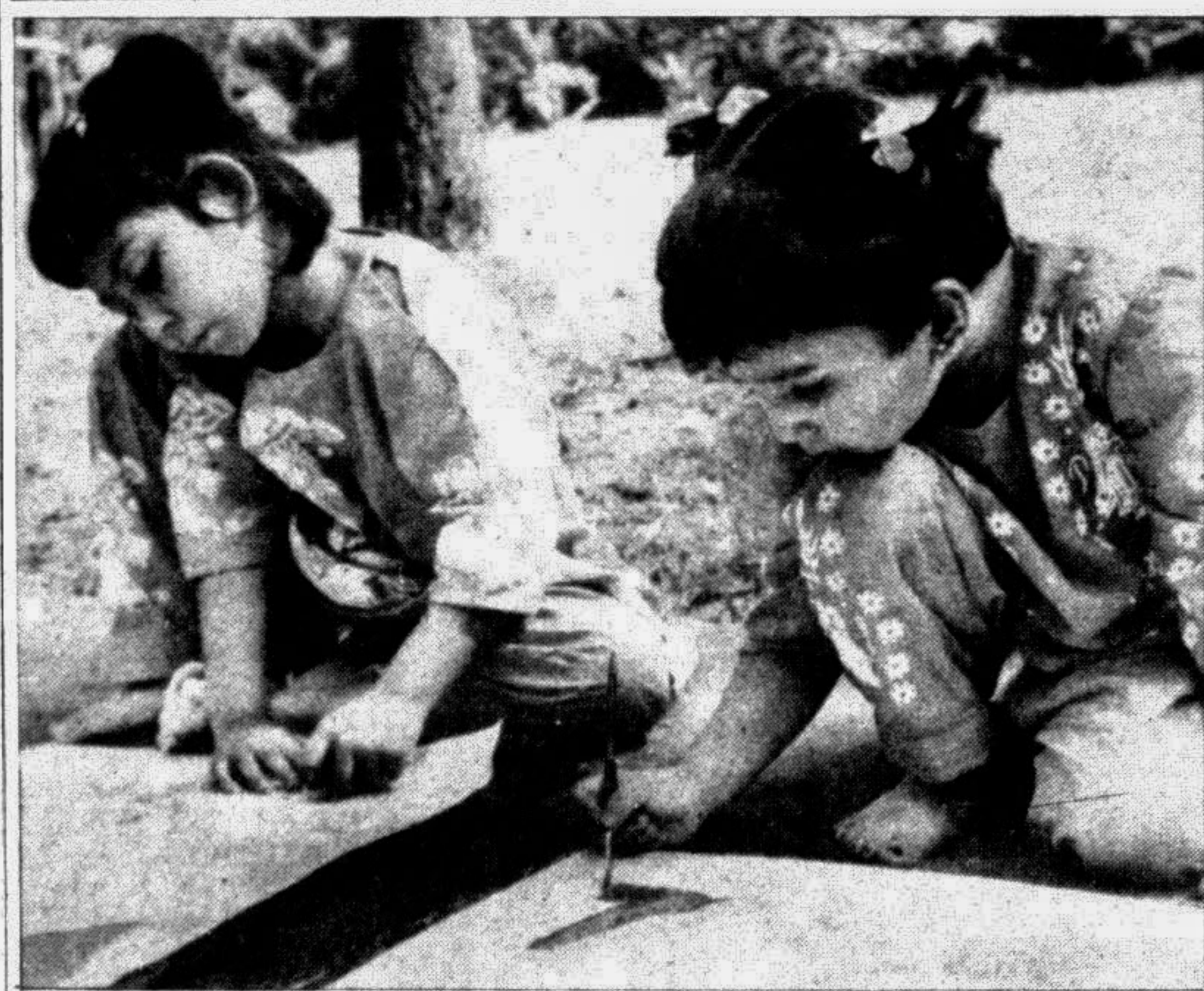
Dr Milon Shishu Kishore Sangsad arranged a painting competition in Shishu Academy compound in city yesterday.

The resolution further, said from May 4 each and every public appearance of the Prime — See Page 12 Col 6