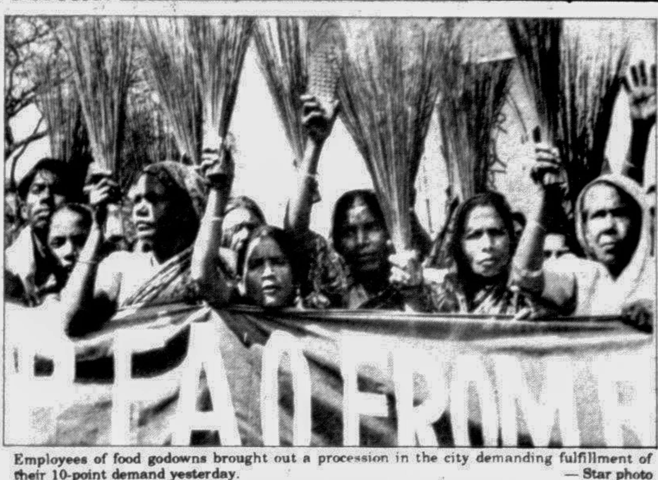
Employees of food godowns brought out a procession in the city demanding fulfillment of their 10-point demand yesterday.