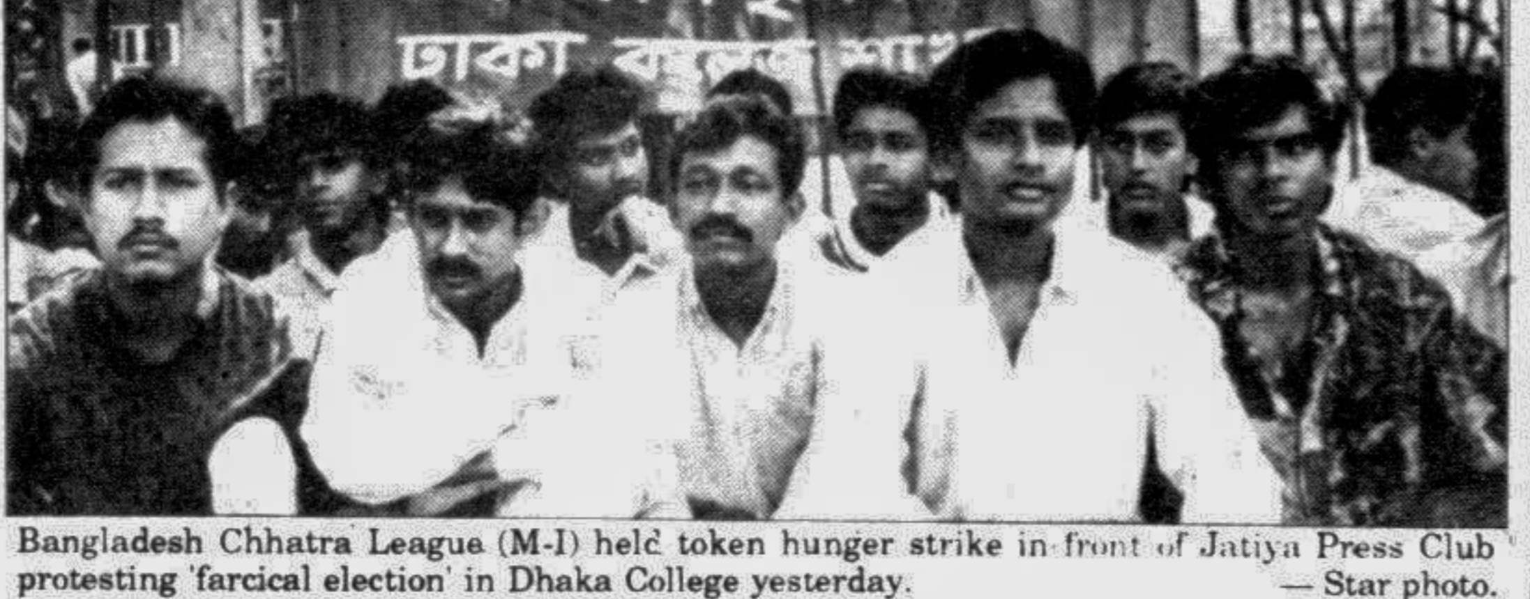
Bangladesh Chhatra League (M-I) held token hunger strike in front of Jatiya Press Club protesting 'farical election' in Dhaka College yesterday.