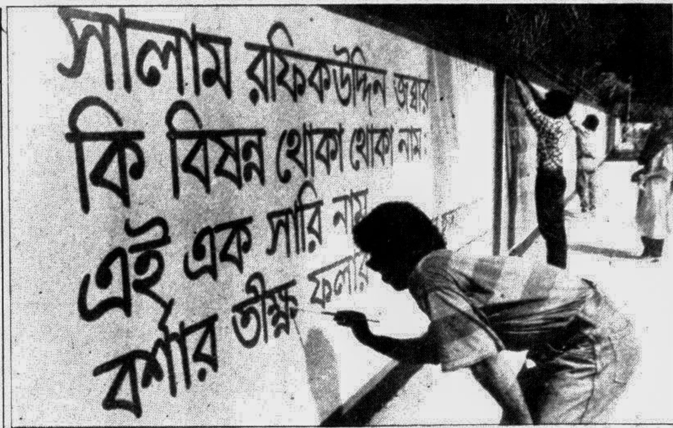
Painters giving a finishing touch to the wall facing the Central Shaheed Minar by inscribing names of martyrs of the Language Movement and quotes from patriotic poems in preparation of the Amar Ekushey.