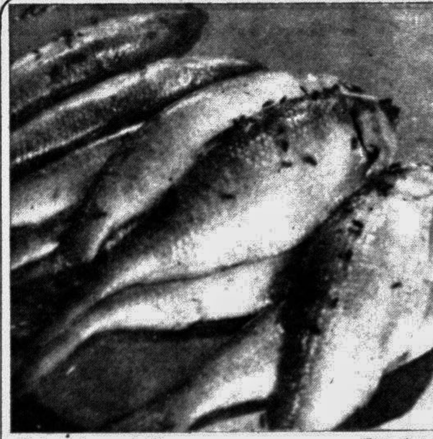
Fish rot for want of ice. — Star photo.

The government yesterday said that it had no plan to increase financial assistance to the families of the seven "Bir Shresthas" or the regular monthly allowances given to the Shaheed families of the country's War of Liberation, reports BSS. Replying to questions put forward by several Treasury and Opposition bench members during the question hour, Labour and Manpower Minister Abdul Mannan Bhuiyan, who spoke on behalf of the Ministry of Defence, said that although the government had no such plan to raise the assistance, it might consider any further rise if required. Major (Retd) Hafizuddin (BNP) thanked the government for giving financial assistance to the family members of the "Bir Shrestha" and other holders of gallantry awards, but proposed that the amount should be raised. Citing an example of financial insolvency of Bir Shrestha Hamidur Rahman, Major Hafiz, who was also a freedom fighter, said that he personally knew that the condition of family members of Shaheed Hamidur Rahman were now in bad shape. BNP member Nurul Islam Moni, narrating pitiable condition of a Shaheed family in his area, urged the government to find out the Shaheed families who were yet to get government benefit even after 21 years of the War of Liberation. Minister Abdul Mannan Bhuiyan said that the government would take immediate action as and when such Shaheed families were found.