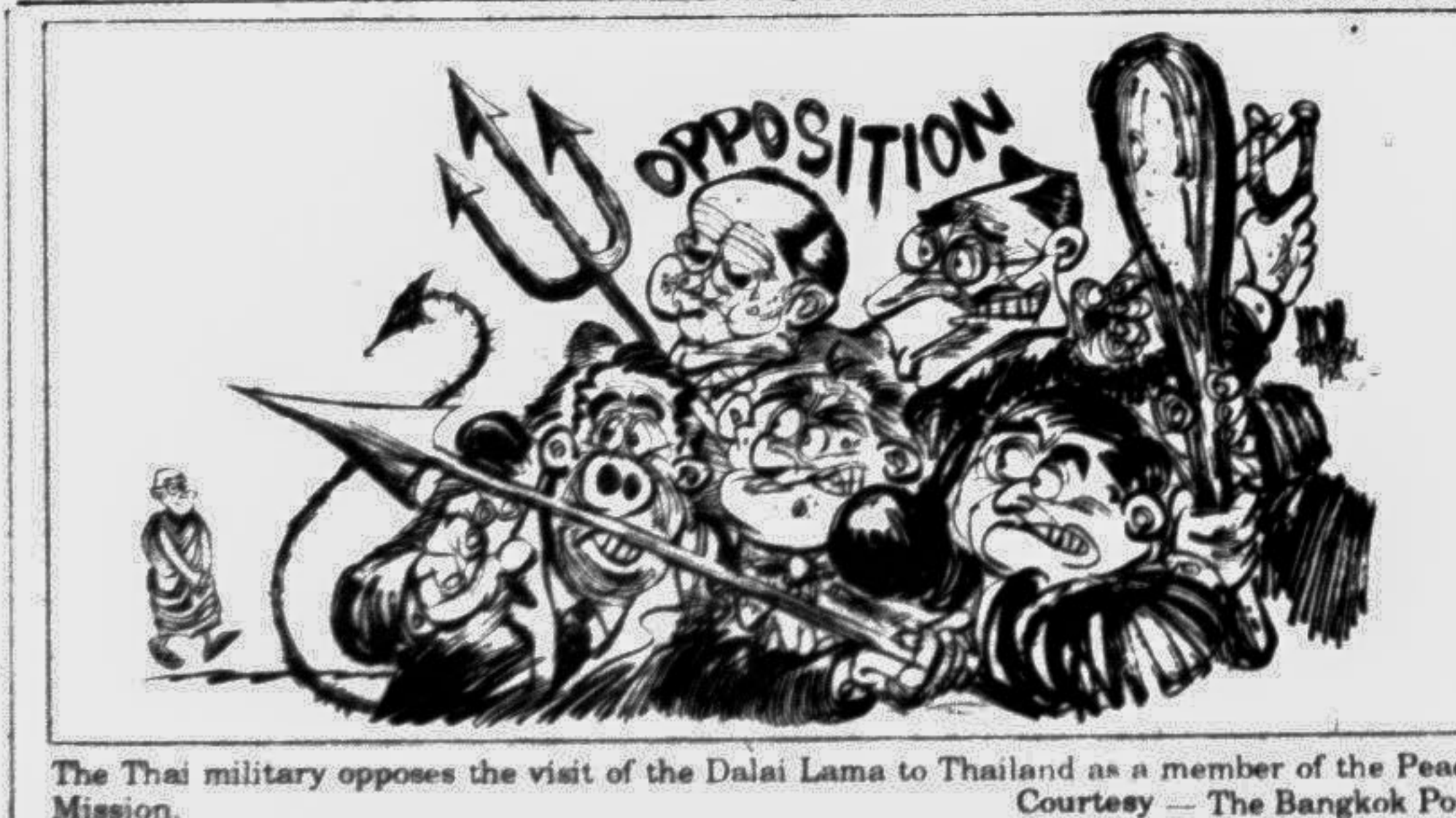
The Thai military opposes the visit of the Dalai Lama to Thailand as a member of the Peace Mission.

cratically elected Thai Government has never been higher, at home and abroad, than it is today. In opposing the arrival of the peace mission, General Wimal had taken particular exception to the inclusion in it of the Dalai Lama, a Nobel Prize laureate, on the ground that it would cause offence to China. The General had also criticised the plan to accommodate the Tibetan leader at Wat Phnom, the home of the country's Supreme Patriarch. The standing of the demo-