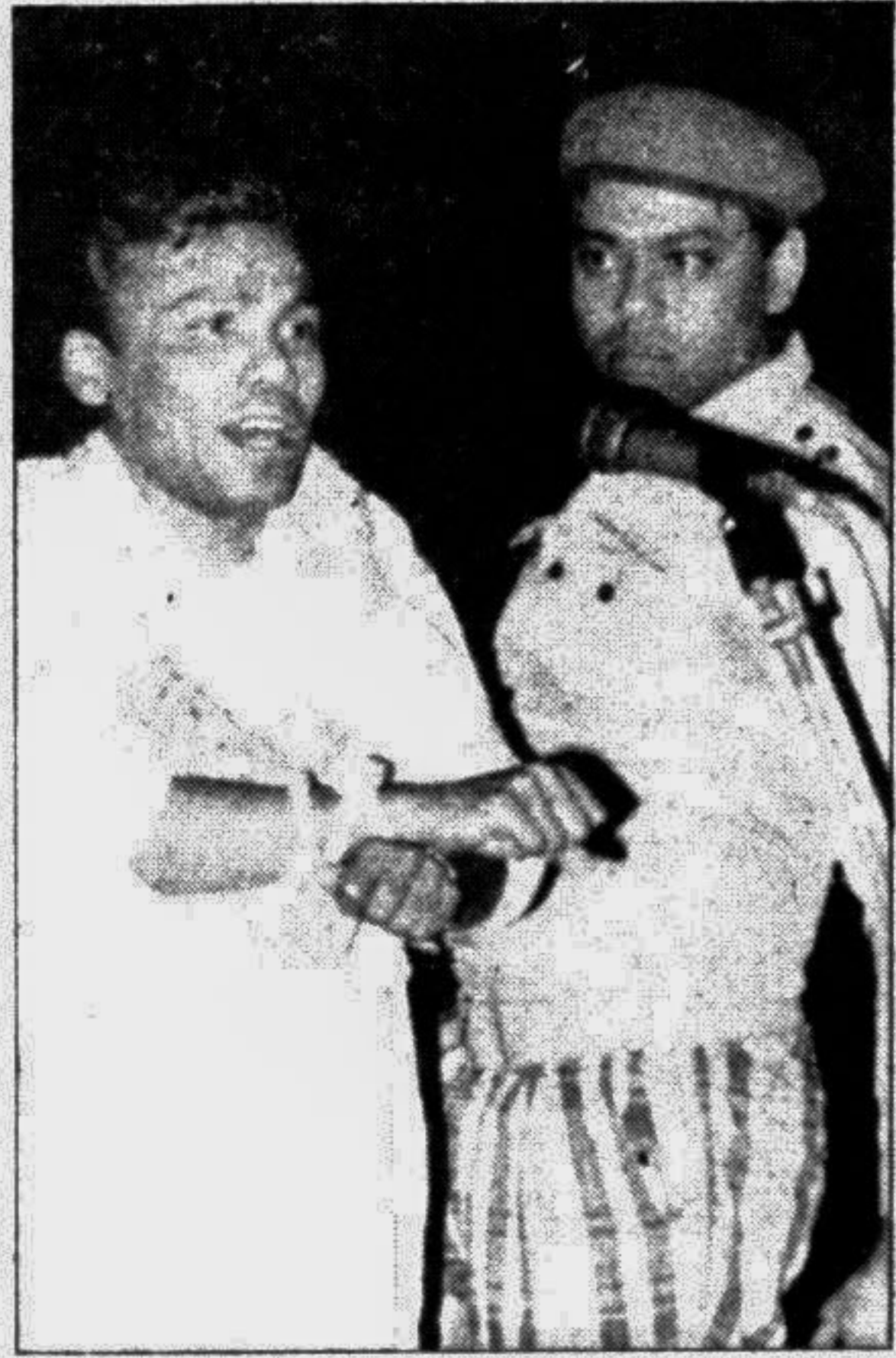
A scene from Zimmy, a play presented recently at the Shaheed Minar.

It is always a pleasure to see young enthusiasts perform with vigour and ingenuity, as was witnessed in the play by the Dhaka City Theatre and the one that followed.